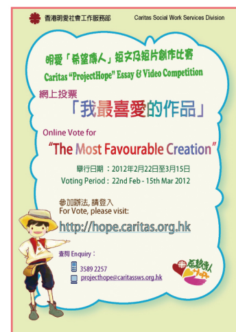
Essay and video competition

The Division had launched a programme “Project Hope” to facilitate the staff as well as the stakeholders to deliver the message “Love in the Service of Hope” through activities in five themes, namely, “Positive Thinking”, “Problem Solving”, “Goal Setting”, “Thanksgiving” and “Volunteering”. During the year, an essay and video competition was launched for the public to cast their vote online. A prize presentation ceremony would be held on 15 April 2012.