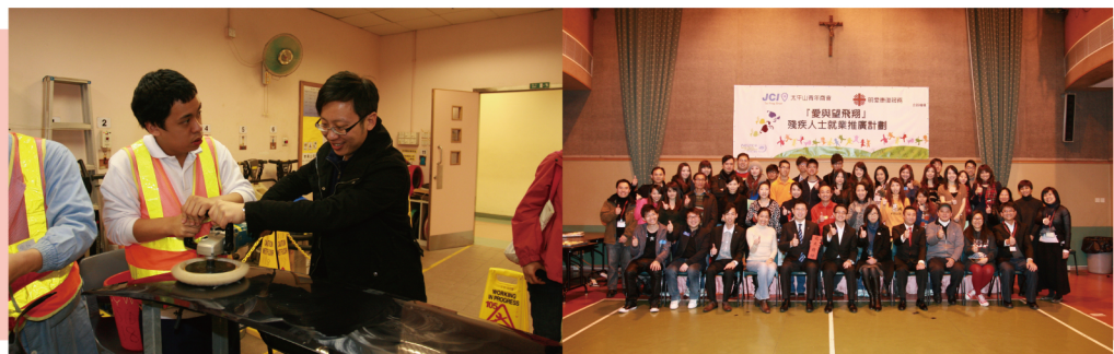
Trainee with intellectual disability assisted his able counterpart to do car waxing