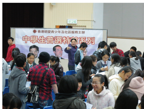
Familiarization among participants at the training programme on Chief Executive Election of HKSAR

“Arts for Community 2011” was a community art project held in Kowloon City District. Apart from an opening ceremony and an exposure programme, a total of 12 different kinds of arts workshops, aiming at encouraging exploration of the district needs, were organized for more than 100 participants from local and ethnic children and youth, old urban area residents, new arrivals and the elders. The arts products created by them expressed the past, present and future of Kowloon City. Exhibition for the public was arranged at Cattle Depot Artist Village from 24 September 2011 to 6 October 2011.