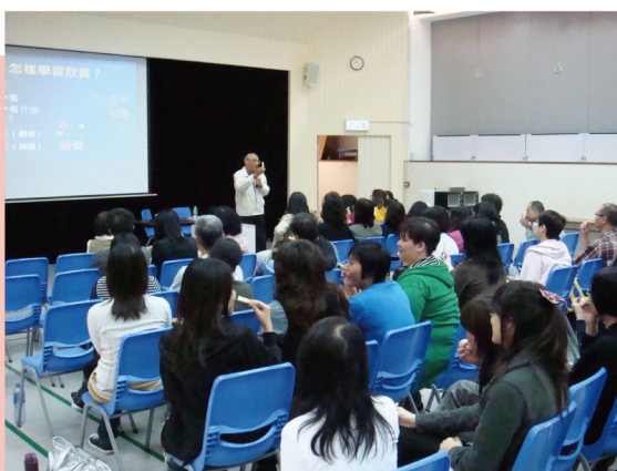
District-based Staff Formation Programmes