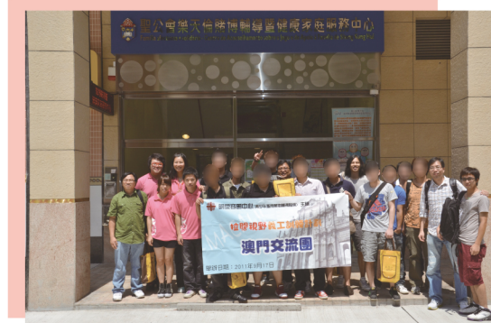
Aiming at broadening participants' horizons and promoting their self-expectation, Caritas Hugs Centre organized a group of clients to go to Macau for study and interflow with the local youth

Caritas Hugs Centre had strengthened the “Supportive Activities for Clients Scheme” with the aim of helping participants to build a healthy lifestyle. “Hugs Not Drugs - Family Support Project” continued and “Dare to Change - Project for Probationers” was introduced to enhance the cooperation between different stakeholders in dealing with the problems of drug abuse, particularly the parents and probation officers. It is envisaged that this would assist the youth.