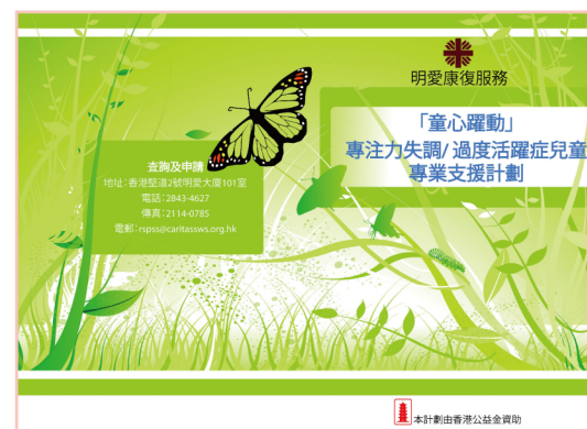
"Professional Support Services for Children with Attention Deficit / Hyperactive Disorder"

A total of $1.80 million had been approved by the Community Chest of Hong Kong for launching of a three-year project named "Professional Support Services for Children with Attention Deficit / Hyperactive Disorder (AD / HD)" effective from April 2011. It aims at providing early intervention programmes for pre-schoolers and rehabilitation training services for school-aged children with AD / HD so as to improve their social and learning skills. Professional support services were also rendered to mobilize the involvement of parents in the rehabilitation process of the children.