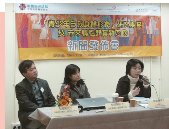
Press conference to announce the research results