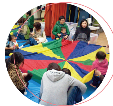
Child-centred Play Therapy is child-focus and not problem-focus

To develop child focus services in family service, a task force on Child-centred Play Therapy has been set up. Systematic training was conducted for social workers to develop their practice competence. Services have started with built-in evidence-based research and on-going support through Community of Practice ("CoP").