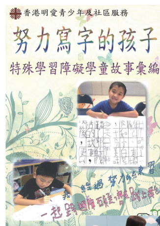
The case book of the kids with specific learning disability

Installation of training equipment in Caritas Learning and Growth Support Centre was completed. Training programmes on sensory integration were provided for the children who had dyslexia, autism, sensory integration problems, attention deficit or hyperactivity. A total of 148 children and 474 parents or teachers were served in 2011/2012. A case book for these children with special educational needs was published in September 2011.