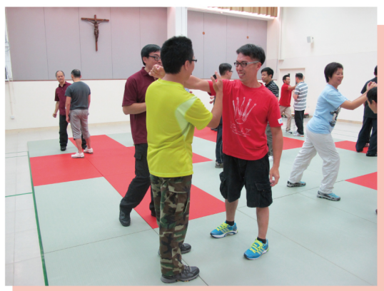
Breakaway Instructor Course

Experienced staff (internal experts) were invited to share their knowledge and experiences in the Good Practice Series, topics included Crisis Intervention & Debriefing, Sex Education, Working with Childhood Trauma Victims, etc.