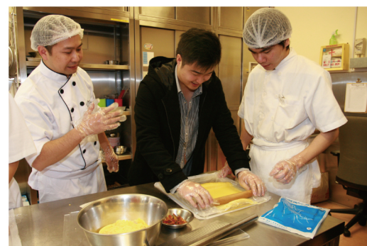
Trainee with intellectual disability demonstrated cookies making to a JCI participant