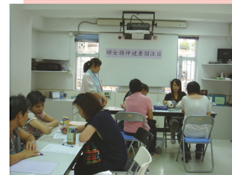
Women Health Concern Day - concerning the retirement needs of both family care takers and domestic helpers

Labour Development Project mobilized the existing labour groups and low-income workers to concern the labour related issues. The Project had held 27 educational talks to introduce Statutory Minimum Wage, Work Incentive Transport Subsidy Scheme and Universal Old Age Pension Scheme.