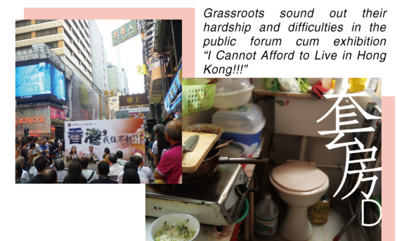
Grassroots sound out their hardship and difficulties in the public forum cum exhibition “I Cannot Afford to Live in Hong Kong!!!”

Grassroots were mobilized to participate in the activities of Grassroots Housing Rights Watch to look into deeply various causes of housing problems. A public forum cum exhibition was held at the iconic pedestrian zone in Mong Kok on 9 October 2011. The event was titled “I Cannot Afford to Live in Hong Kong!!!”. Practical measures responded to grassroots’ housing needs were concluded in the event. In order to arouse the public concern on the livelihood of people living in the partitioned cubicles, a booklet “Cubicle D” was published.