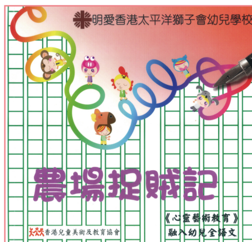
One of the stories written by children and teachers

A series of art education training programmes named “Integrated Spiritual Art Education in Children Literacy” subsidized by the EDB under the Teacher Development Subsidy was organized for the teaching staff of nine nursery schools. Consultation and school visits were arranged by the trainer. Children were benefited from the art activities arranged by the teachers. More than 20 stories written by children and teachers were published.