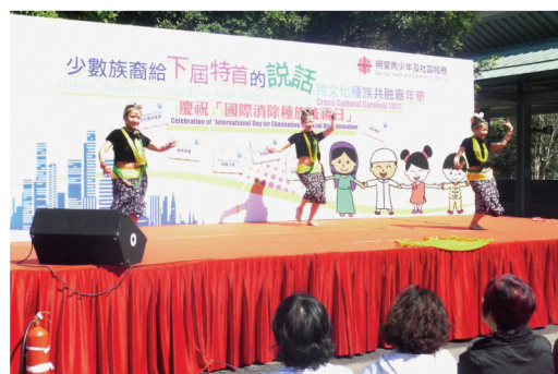
A group of Nepalese girls were dancing in celebration of “International Day for Elimination of Racial Discrimination”

To arouse the youth’s awareness on the Hong Kong Chief Executive Election 2012 and to provide a platform for views exchange between secondary students and the candidates, a series of programmes were held. There were over 4,600 participants.