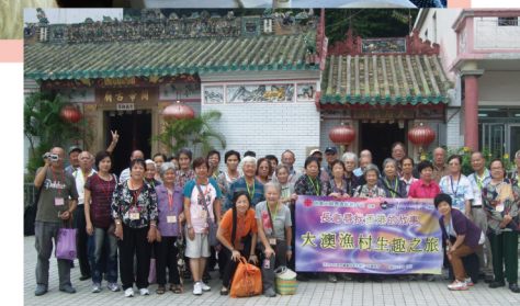
Elders paid visit to heritage at Tai O