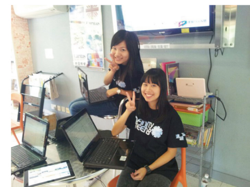
Two social workers were interviewed by the press. They demonstrated how to work on internet

“Sexuality Zone” was community based clinical psychology service newly developed by YCS. It responded to the aggravation of sexual behavioural problems among young people. The project has engaged different professions including youth workers, sex therapists and clinical psychologists.