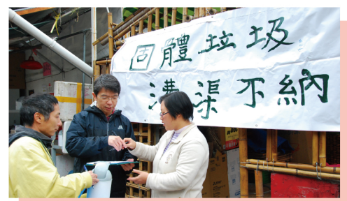
Group members promoted a new social contract on keeping environment clean

Caritas Pokfulam Community Development Project has been working with the residents of Pokfulam Village on the hygiene issues for many years. During the year 2011/2012, the villagers launched a movement named “Action for the Sewage System”. They organized campaigns and exerted pressure on the government. As a result, the Drainage Services Department agreed that it is feasible to put forward the villagers’ proposal of building a sewage system in the village.