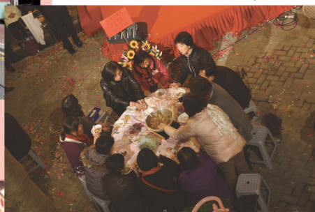
“How delicious is the ‘pun Choi’!”

The celebration concluded with a “pun Choi” dinner party (盆菜晚宴) and an exhibition in the Centre, a historical building which had once been serving as the Royal Air Force Officers Quarter and Vietnam Refugees Camp.