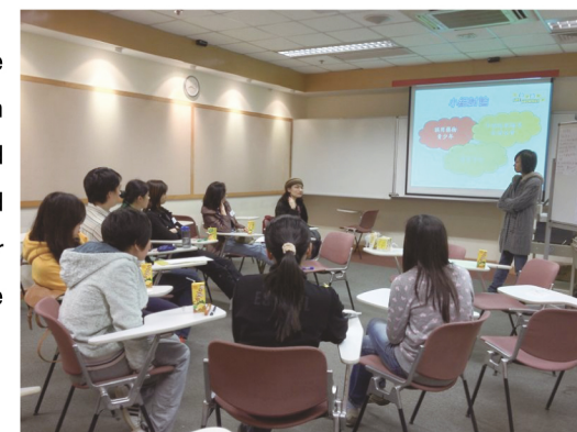
Life Buddy Programme Training Workshop provided by Life Architect II

“Life Architect II” used online media to locate young drug abusers. Online drug education and counselling services were delivered through this platform. The project also provided counselling services and medical services for young sex workers who had drug abuse problems.