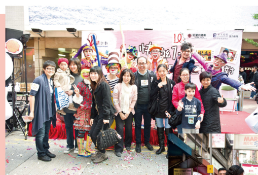
Take a photo for good memory!

The celebration was followed by a carnival “Double Our Happiness – an interactive Christmas Party” organized by the Everbright Project on 17 December 2011 with stage performance and parade.