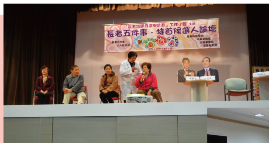
Candidate Forum of the Chief Executive Election