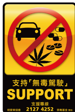
Specially designed “Say No to Drug Driving” logo