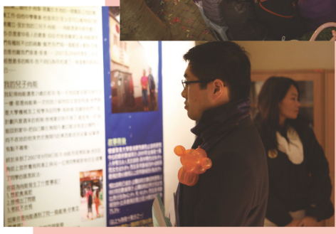
A visitor reading a display board on the history of the Centre

The celebration concluded with a “pun Choi” dinner party (盆菜晚宴) and an exhibition in the Centre, a historical building which had once been serving as the Royal Air Force Officers Quarter and Vietnam Refugees Camp.