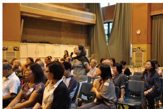
Parent representatives participated actively in the open forum of the annual meeting