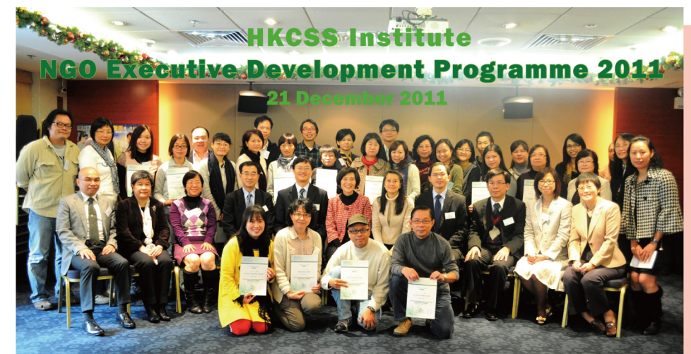
Training programme for mid-level staff

With the Social Welfare Development Fund allocated by SWD, staff members attended 276 in-house as well as external training programmes during the year, of which 5 were overseas study visits and 5 were leadership and management skills development programmes for mid-level staff. A total attendance of 1,657 was recorded. Besides, 31 staff members were granted paid leave to attend fieldwork placement of their professional training programmes, while sponsorship was given to 3 staff members to attend nurse training programmes.