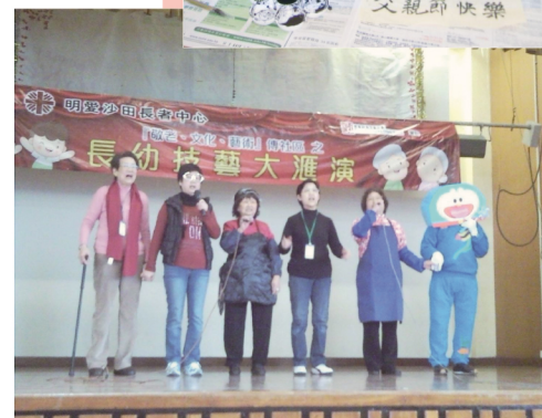
Elders played a drama with the theme on positive life attitude