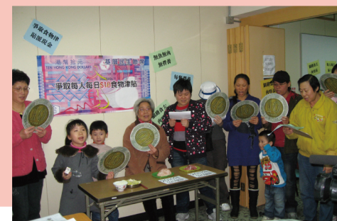
“We want food subsidy of $10 per person per day”

The Network of Grassroots Families launched a petition to the Chief Executive on the eve of the announcement of The Policy Address 2011/2012. The representatives appealed for the provision of food subsidy of $10 per person per day so as to release the financial burden of grassroots families.