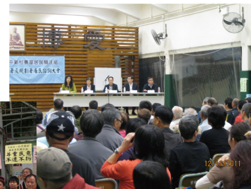
Consultation meeting organized by Tan Kwai Tsuen, Wo Ping Sun Tsuen Squatter Area Residents Concern Group

In response to the Hung Shui Kiu New Development Area Planning and Engineering Study, the Tan Kwai Tsuen, Wo Ping Sun Tsuen Squatter Area Residents Concern Group was formed and communicated with the government departments of their concerns.