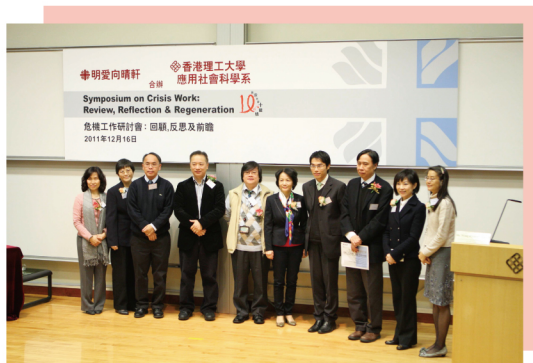
The guest speakers and officiating guests came together for a photo after the opening ceremony of the Symposium

Being the first crisis support centre in Hong Kong since 2001, Caritas Family Crisis Support Centre celebrated its 10th anniversary through a series of activities, starting with the Symposium on Crisis Work: Review, Reflection and Regeneration held on 16 December 2011 in collaboration with the Department of Applied Social Sciences, the Hong Kong Polytechnic University. Experts in crisis work were invited to share their professional knowledge and experience. There were 150 participants joining the event with positive responses.