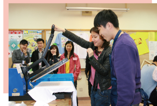
Interactive activity brought the able and disabled together

A joint venture named “Project of Love and Hope – Promoting Employment of Persons with Disabilities” was launched with the Junior Chamber International Tai Ping Shan (“JCI”) in early 2012. Two large scale public education activities and two surveys exploring the current employment condition of persons with disabilities and the views of the employers in the business sector were conducted. Various creative promotional strategies including a video, a theme song and an “Apps” were used to convey the message to the public.