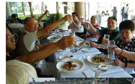
Participants enjoying delicious western cuisine

The Li Ka Shing Foundation granted a sum of $655,000 to Caritas District Elderly Centre – Yuen Long to organize five projects in Yuen Long. The contents included visits to heritages, sharing of folklores, enjoy foreign foods, accomplishment of elders' wishes, strengthening of community network for the singleton elders, and training of volunteers for provision of in-home training to elders with dementia. Totally 2,050 elders were benefited from these programmes.