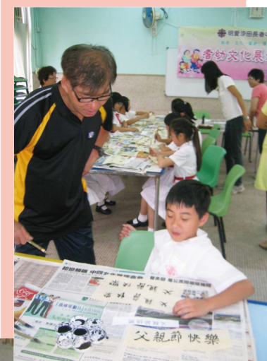
Elders teaching calligraphy