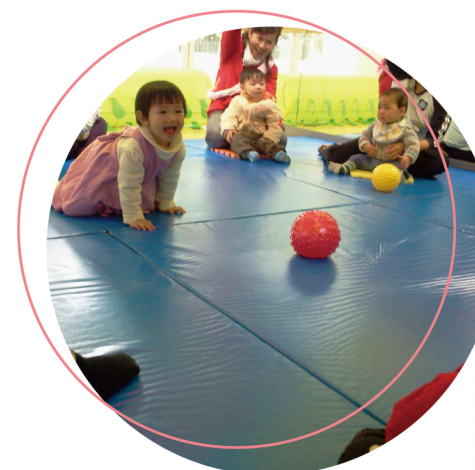
Play is the language of a child whereas toys are the words. Child-centred Play Therapy helps to build up a parent-child relationship with acceptance and warmth