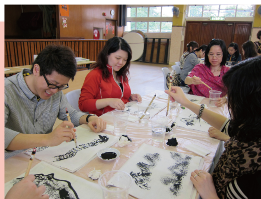
An art education training programme to strengthen teachers' aesthetic skill and cultivate the culture of art appreciation

The Departmental Evaluation Meeting for Administrators 2012 with the theme “Addressing Relational Poverty, Achieving Relational Goals” was held on 15 March 2012 and 16 March 2012. A Three-year Service Development Plan (2012-2015) has been formulated. Three domains for areas of improvement have been thoroughly discussed. Fourteen resolutions have been finalized for implementation with the objectives (1) to nurture caring culture through strengthening Agency’s Vision, Mission and Value, and to promote spiritual growth of staff; (2) to enhance the professional development of staff and to formulate strategies for succession planning; and (3) to strengthen the multi-discipline partnership collaboration.