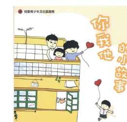
“My Stories. Your Stories” depicts the life of the poor with photos, comics and words