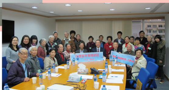
Meeting with one of the candidates of the Chief Executive Election