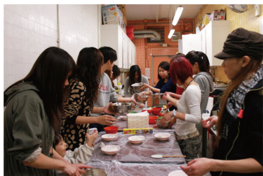
Cookery training was conducted for the participants of “Mission in the Dark”

The Project “Mission in the Dark” was carrying out via internet and targeting at high risk girls who might have involved in various commercial sexual activities. Social workers also reached out to night clubs to identify high risk girls and recruit them to participate in the AIDS prevention and anti-drug education programmes.