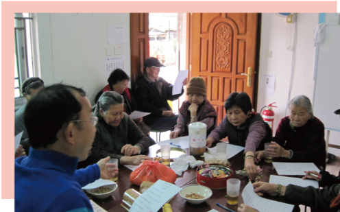
Residents joined together to discuss how to improve the environment

The organizing committee of the “Cultural Heritage of Hong Kong Fishery in Cheung Chau” conducted an evaluation for the project and concluded to further develop a regular fishery culture tour programme. The programme would generate income for maintenance of the public places and facilities within the village.