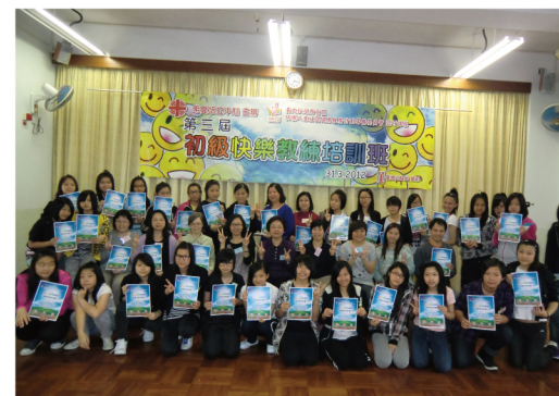
Graduates of the 3rd Junior Happy Coach Training Course

After the completion of the “Happy Coach Trainer” Training Programme organized by the Happy Living Community Health Promotion Project of the Wong Tai Sin/Sai Kung District by three staff members last year, three Junior Happy Coach Training Courses were organized for students, parents and staff with a total of 186 graduates.