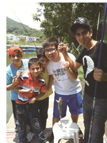
Exchange programme among local people and ethnic minority

Caritas – Hong Kong continuously organized cross-cultural learning and exchange programmes, exploration activities, community voluntary services, training programmes, career orientation programmes and social integration programmes to promote understanding and mutual respect between ethnic minority groups and the local communities in various districts.