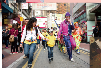
All the participants enjoyed the stage performance by magicians and clowns. “Let’s play and share our happiness!”