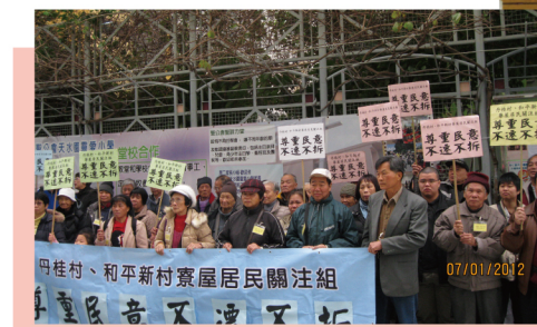
The concern group members petitioned the government for retaining their villages