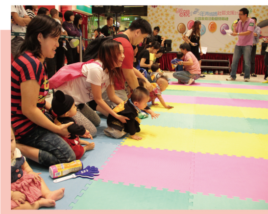
Baby Crawling Competition in the Kickoff Ceremony of “Young Mother Community Support Project”

The Young Mother Community Support Service was launched in East Kowloon District on 1 April 2011. The project served 60 disadvantaged young mothers below the age of 24 who had been child abuse victims, drug addicts or mental health patients etc.. The young mothers and their children were assisted to achieve better health and quality of life. The project also aimed at arousing public concern, understanding as well as acceptance to the young mothers and their children.