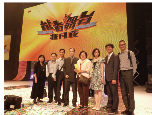
The Hong Lin Restaurant received the “Helping Hand Career Support Award”

Caritas Lok Mo Integrated Vocational Training Centre had been collaborating closely with its service partner, the Hong Lin Restaurant, to provide job attachment programme and employment opportunity for the disabled graduates of the Centre. The Restaurant had supported enthusiastically the trainees with various types of disabilities by offering jobs in the catering and servicing business and giving good career prospects. The Restaurant was being nominated and presented with the grand “Helping Hand Career Support Award” in an event named “Rehabilitation Special 2011” which was jointly organized by the Labour and Welfare Bureau and Radio Television Hong Kong.