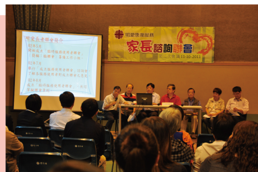
Representatives from the Caritas Federation of Senior Citizens shared their experience in policy advocacy

The Joint Parents Advisory Committee of Caritas Rehabilitation Service had its second annual meeting on 11 October 2011. Members of the Caritas Federation of Senior Citizens under Caritas Services for the Elderly were invited to share with the parents their valuable experience on the development of their Committee and the empowerment process. Meanwhile, Caritas Rehabilitation Service had also set up two parents concern groups to advocate concern on inclusive education and employment of people with intellectual disabilities.