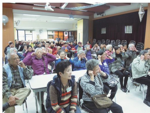
Carers learning the relaxation exercise in a Carer Support Programme

training on caring skills would be offered to the elders' family members. Up to the end of March 2012, the project had served 269 elders and trained up 24 volunteers.