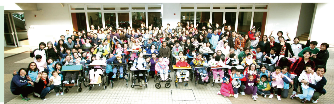
A family photo taken at the Christmas party

participants joyfully treasured the opportunity to communicate and share their happy memories with one another in the new campus.