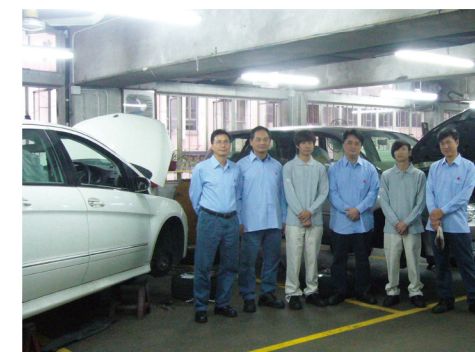
Staff and trainees of Caritas Car Repair Workshop