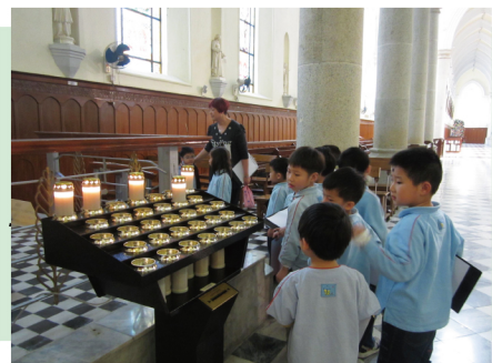
Zippy’s Friends Learning Activity: Children visited the Cathedral of the Immaculate Conception

There is an increasing concern on both the physical health and mental health of young children at their early pre-school stage. To promote mental health and emotional well-being of young children, Caritas pre-schools joined a universal programme “Zippy’s Friends” aiming at teaching children to identify and cope with difficulties, to express their feelings and to explore ways of dealing with them. Through a variety of activities, the children were encouraged to help themselves and to face their difficulties.