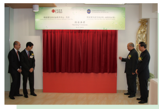
The Opening Ceremony of the Centre