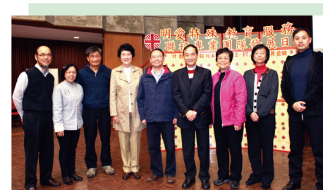
The school principals joined in a photo with the speakers