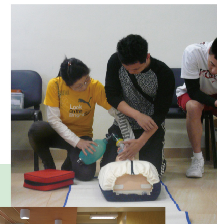
ApL Taster Programmes

A total of 637 secondary students from 107 secondary schools participated in the ApL Taster Programme for the 2012/2014 cohort.