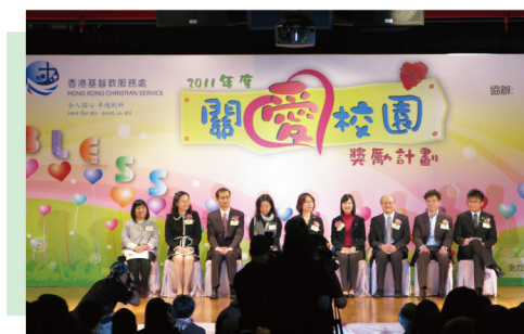
Caring School Award Scheme 2011

Caritas St. Joseph Secondary School, Caritas Tuen Mun Marden Foundation Secondary School, Caritas Fanling Chan Chun Ha Secondary School and Caritas Ma On Shan Secondary School were awarded the “Caring School Award” of the Caring School Award Scheme jointly organized by the EDB, Hong Kong Christian Service and Hong Kong Association of Careers Masters and Guidance Masters in 2011. The Scheme aims to promote caring school culture in schools.