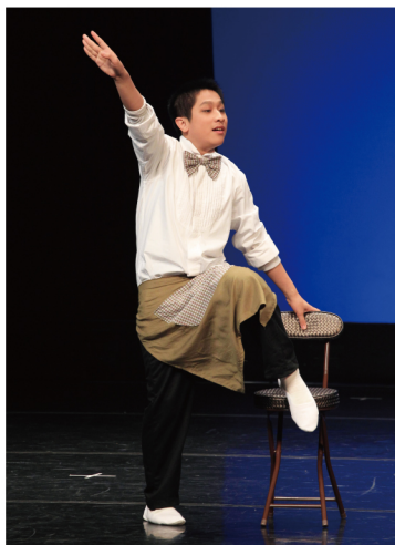
The modern dance "Cutie Chef" of Caritas Resurrection School