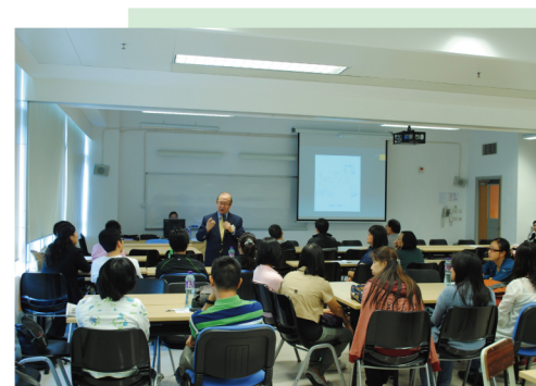
Group discussion in the Joint-school Staff Development Day 2011/2012