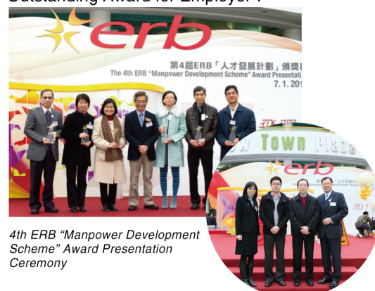
4th ERB “Manpower Development Scheme” Award Presentation Ceremony

The 4th ERB “Manpower Development Scheme” Award Presentation Ceremony was held on 7 January 2012. CHES received an award of “ERB Outstanding Award for Placement Service”. One of CHES students was awarded “ERB Outstanding Award for Trainee”. One of the employer nominees was awarded “ERB Merit Award for Employer” and two of the employer nominees were awarded “ERB Outstanding Award for Employer”.