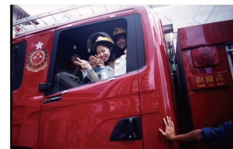
The Fire Safety Ambassador Scheme

Various activities which were supported by the EDB were organized for CHES full-time PYJ students in the year 2011/2012, such as: