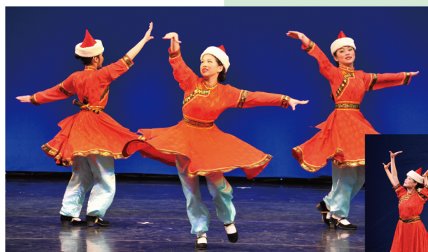
The marvelous Mongolian dance of Caritas Pelletier School