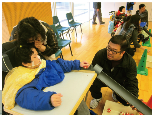
Community volunteers patiently interacted with the students in the inclusive activities