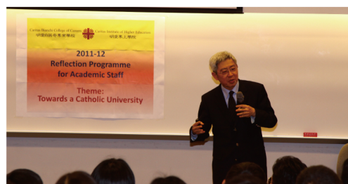
2011/2012 Reflection Programme for Academic Staff of CIHE and CBCC

CIHE and CBCC have taken a proactive approach to achieve their staff development goals and organized seven in-house staff development activities for staff members in the year 2011/2012.