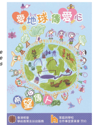
A booklet “To Love Our Earth, To Love Others” with rhymes written by children

pre-schools were arranged. The successful experiences and strategies in learning Chinese language and the learning outcomes of young children were shared with academics, principals and teachers of the early childhood sector in March 2012.