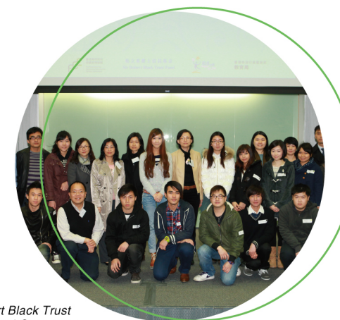
Sir Robert Black Trust Fund Award Ceremony

Sir Robert Black Trust Fund Award Ceremony was held on 11 January 2012 at EDB Kowloon Tong Education Services Centre, 32 CHES PYJ graduates received the awards.