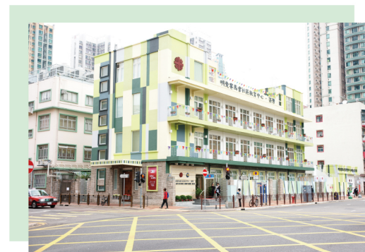
Caritas Jockey Club Institute of Community Education – Tsuen Wan

With a $28 million grant from the Hong Kong Jockey Club Charities Trust, the heritage building in Chung On Street, Tsuen Wan has been revitalized and named as Caritas Jockey Club Institute of Community Education – Tsuen Wan ("CJCICE – Tsuen Wan") to provide comprehensive education services to the community in the area of healthcare. The Opening Ceremony of the Centre was held on 8 December 2011.