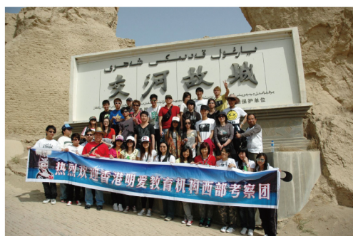
Study Tour in Xinjiang

Taster Programmes organized by CIHE, CBCC, Caritas Cosmetic Career Center and CJCICE – Tsuen Wan for CHES PYJ students were held on 19 March 2012, more than 300 students participated. The programmes were designed for CHES students who wish to explore their options for further studies and obtain first-hand experience of post-secondary education.