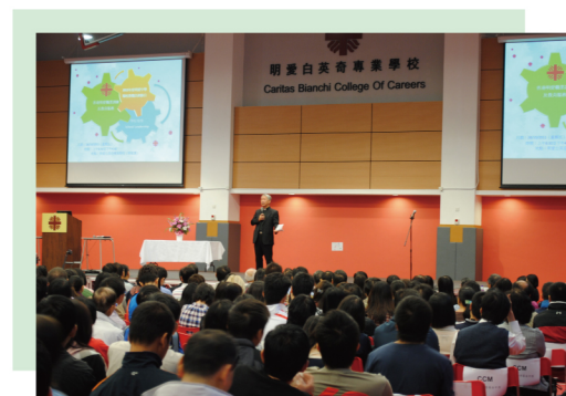
Speech by guest in the Joint-school Staff Development Day 2011/2012

Twenty group discussions on various topics were arranged in the afternoon sessions with topics including case studies of school development, sharing of experience in school middle management, campus evangelization, solutions for students’ learning diversity, methods for relieving pressure and maintaining physical and mental health of teachers.