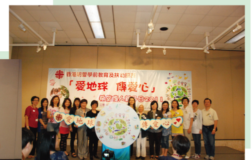
Kickoff Ceremony at the Joint School Parent-child Day