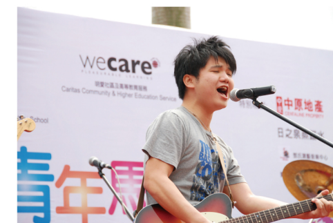
The Fifth Youth Music Marathon Concert