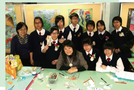
A craft work lesson (one of the broad curricula) in a Caritas secondary school