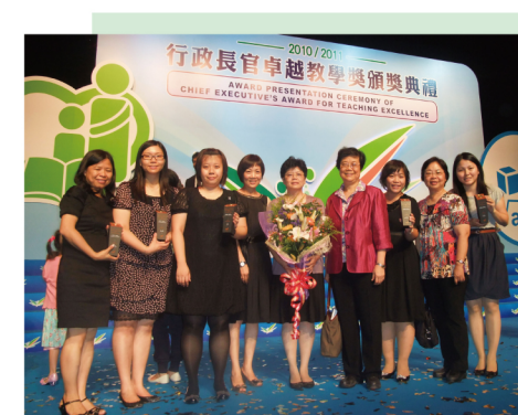
A moment of gratitude and assurance

The projects of Caritas Pelletier School on "Nurturing Students' Growth" and "Enriching Book-reading Interest" were concurrently awarded the "Certificate of Merit of the Chief Executive's Award for Teaching Excellence" in July 2011. This was a great encouragement to the effort and enthusiasm of staff members.