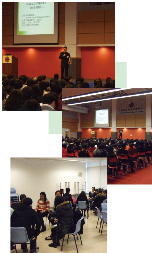
CHES Staff Development Day 2011

CIHE and CBCC have taken a proactive approach to achieve their staff development goals and organized seven in-house staff development activities for staff members in the year 2011/2012.