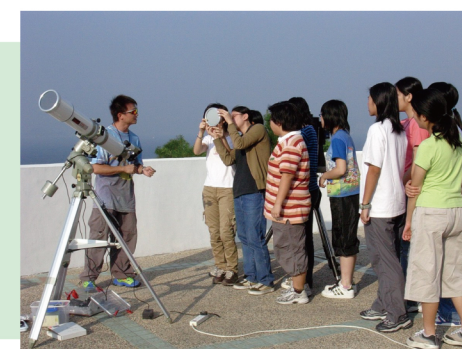
An astronomy course in the Caritas Field Studies Centre

Caritas – Hong Kong also runs a field studies centre in Cheung Chau to promote environmental understanding and to cultivate concern and awareness of sustainable development in the natural habitats. The centre offers field studies programmes on natural science, biology, geography, environmental studies, and pollution studies for all primary, secondary students and teachers in Hong Kong.