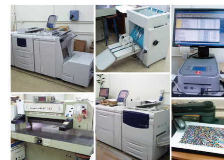
Equipment in Caritas Printing Training Centre

VTES operates nine secondary schools (eight aided schools and one Direct Subsidy Scheme school) offering a balanced and broad curricula through which students acquire their knowledge and skills under Catholic ideology.