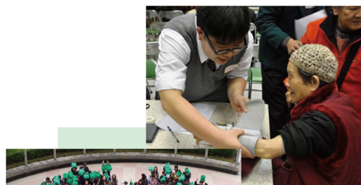
Joint Schools Volunteers Day