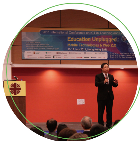
International Conference on ICT in Teaching and Learning 2011

The International Conference on Information and Communication Technology ("ICT") in Teaching and Learning 2011 was organized and hosted by CIHE, CBCC and other partners at CBCC Tseung Kwan O Campus from 11 July 2011 to 13 July 2011. The event had attracted participants from all over the world.