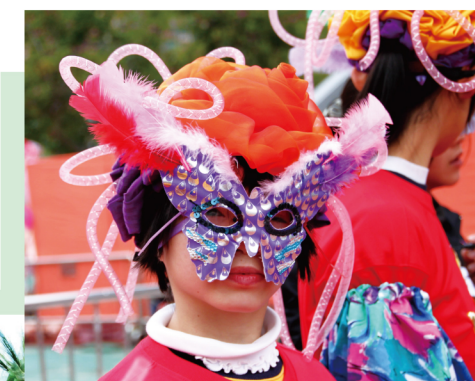
Students dressed in costume made by parents at the kickoff parade of the Joint School Sports Day

Caritas Resurrection School and Caritas Lok Jun School jointly organized a variety show in June 2011, with “Wishes” as the theme. The students of Caritas Ma On Shan Secondary School were invited to join in the performances. The two schools also hosted a Joint School Sports Day in February 2012, and students of outside special schools were invited to take part.