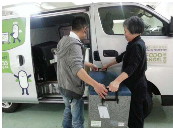
Volunteers delivered and distributed meal boxes to the needy

In view of the financial burden of low income labourers and their families, CDS collaborated with Food Angel to provide hot meals to those in need in Sham Shui Po and Eastern District (Hong Kong Island). Caritas Labour Development Project also organized monthly talks to introduce community resources for low income labourers and provided assistance for them to submit application to the Work Incentive Transport Subsidy Scheme.