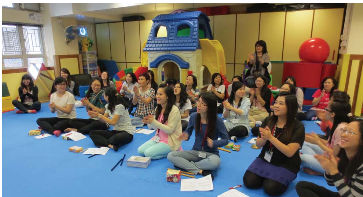
Musical Movement Workshop