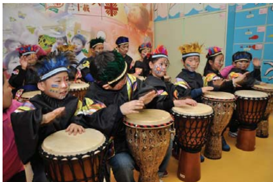
Disabled children were playing Djembe to celebrate the 30th anniversary of Caritas Lok Hing Child Care Centre

In celebration of the 30th Anniversary of Caritas Lok Hing Child Care Centre, a ceremony cum Open Day was held on 21 December 2013 involving all trainees, training staff, parents and community partners. The performance of the children during the occasion had won great applause of the guests.