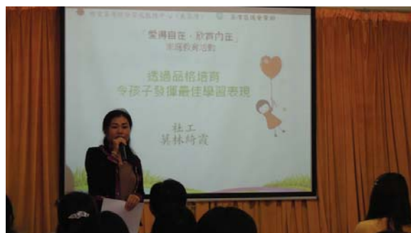
Campaign of ‘Love Freely, Appreciate the Inner Self’ received positive feedback from the community