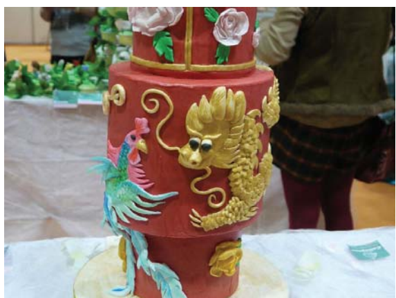
▼ The showpiece, "Dragon & Phoenix" - revealed the talent of young mothers in art through complex traditional decoration