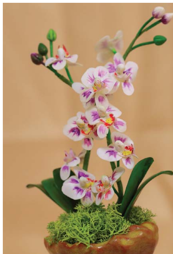
Another awarded artwork