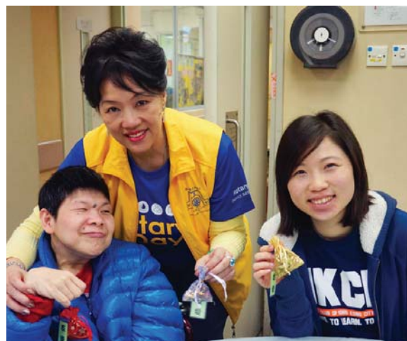
Involvement of younger generation in service