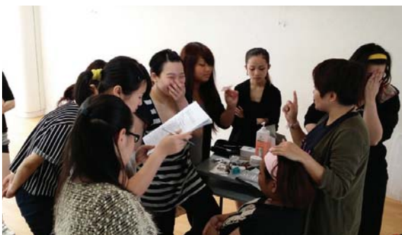
▼ Make-up class