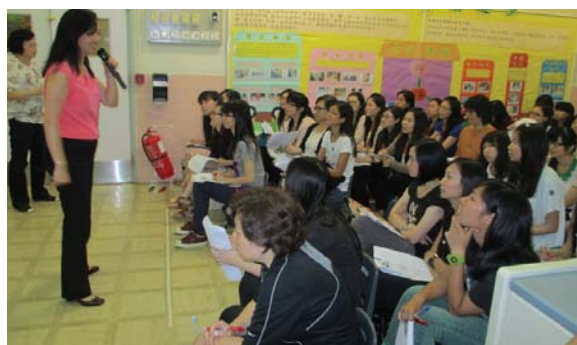
Workshop on English learning for young children

To strengthen the professional capacity for teachers, a series of workshops and training course on English learning for young children, religious education, musical movement in pre-school were organized by the Service. Good practices was shared among teaching teams.