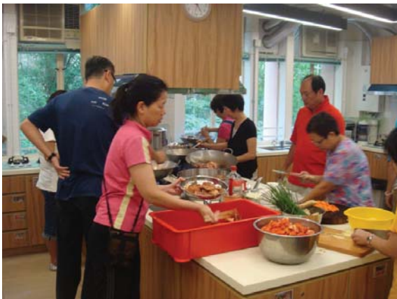
Parishioners prepared delicious meal

“Meal for Grassroots” became a regular community service programme. It aimed at extending the network of low income families, enhancing their community participation and encouraging concerns on the livelihood of low income families so as to reduce relational poverty in the community. Parishioners of Our Lady of the Rosary Church participated in “Come Dine with Us” organized by Caritas Mok Cheung Sui Kun Community Centre. They prepared meal and shared life experiences with the grassroots from the Western District. Caritas Community Centre - Ngau Tau Kok also mobilized many corporate partners, donors, sponsors, parishioners and volunteers to contribute their strength and ability in the programme.