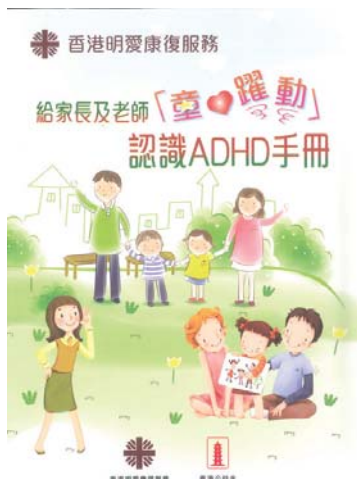
Practical guide book on supporting children with AD / HD

Two public seminars were held to share the Project team's effort and experience in supporting children with Attention Deficit / Hyperactivity Disorder ("AD / HD") and their parents. The practical guide book on supporting children with AD / HD was published and delivered to parents, teachers and other professionals who are working for children with AD / HD. The number of enquiries increased significantly after these public education programmes.