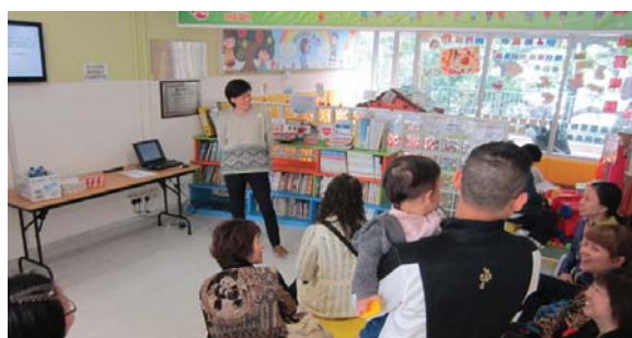
Parents actively participated in the “Character First” parenting course

Caritas Integrated Family Service Centre - Tsuen Wan had organized two promotion campaigns with funding from Tsuen Wan District Council. Adopting the essence of positive psychology, the campaigns aimed to promote the building of character strength with the emphasis on moral education as the cornerstone of parenting and children development. The family core value of “appreciation and love” was promoted through various school-based education programmes as well as children and parenting groups in the community. The message was also highlighted in all the services provided for children and parents.