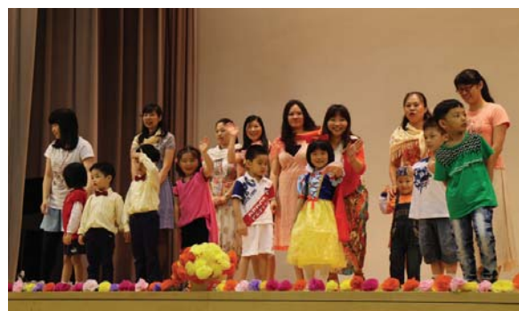
Parent volunteers performed on Mother's Day