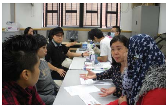
▼ Health Concern Day