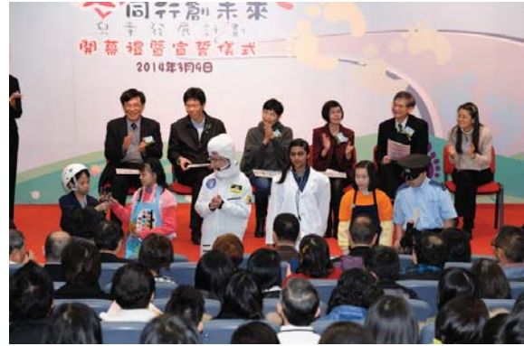
Government officials and representative of Hung Hing Ying and Leung Hau Ling Charitable Foundation officiated in the Opening cum Oath-taking Ceremony.