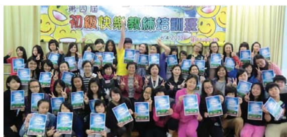
Graduation Ceremony of the 4th Junior Happy Coach Training Course