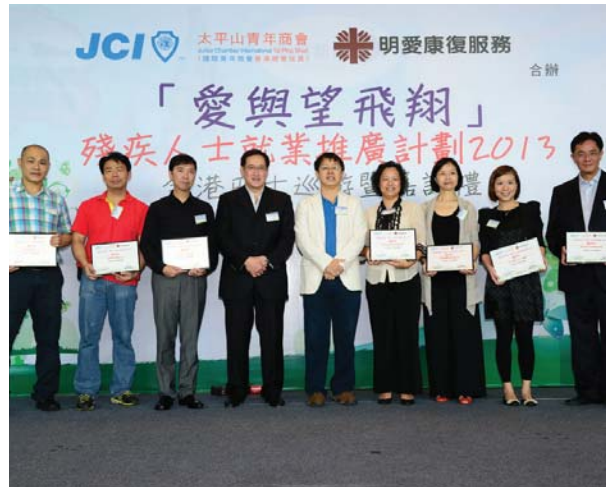
▲ Award to corporations which employed people with disabilities

In collaboration with the Junior Chamber International Tai Ping Shan, a programme named “Love and Dream Bird – Bus Parade” was organized. More than 70 corporations had been awarded for their support and contribution in employing persons with disabilities. As at 31 March 2014, 26 people with disabilities had been employed by the Service.