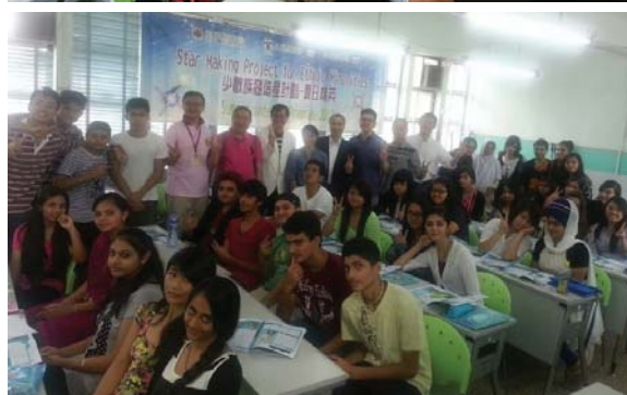
▼ "The Star Making Project for Ethnic Minorities" was co-organized by Caritas Community Centre – Kowloon, Kowloon Chamber of Commerce and Kowloon City District, Hong Kong Police Force with the assistance of curriculum development expert