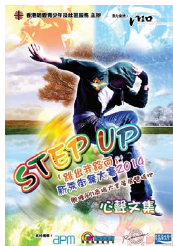
▼ A collection of the participants' sharing