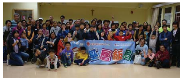
Group photo of participants and parishioners