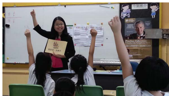
► Motivation is key to learning behaviour