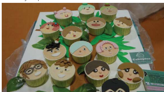
▼ The showpiece, "My Family" - revealed the importance of family support for young mothers

Some young mothers took part in the Hong Kong Bakery Expo 2013 as Cake Artist