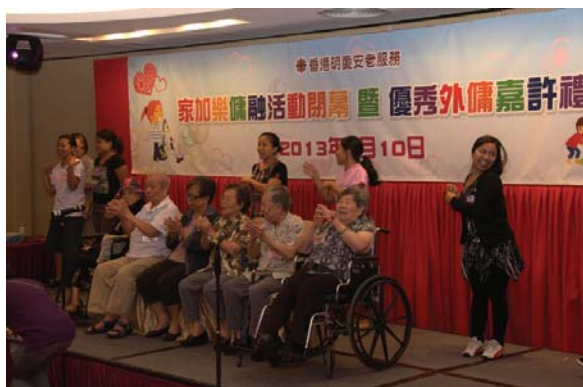
Domestic helpers and the elders were performing together