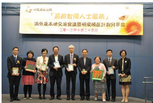
▼ The guest speakers and officiating guests joined to take a photo

With the support of the Social Welfare Development Fund, the “Local and Overseas Seminar cum Sharing for the Project for Persons with Intellectual Disability in the Time of Ageing” was organized on 25 October 2013. Local and overseas scholars and professionals from Taiwan and Macau shared experience on existing practices and service models to support seniors with intellectual disabilities. Over 200 rehabilitation personnel and carers participated and found the seminar very informative.