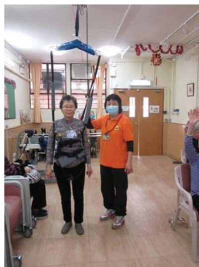
Walking exercise with aid of ceiling hoist