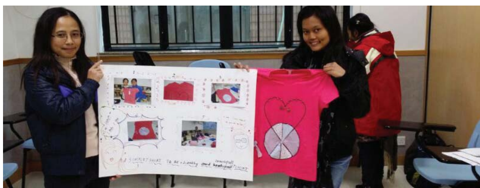
▼ Language programme for Asian migrant workers