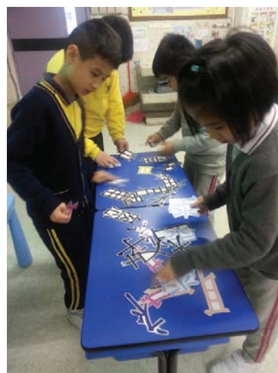
► Multisensory approach to help learning Chinese