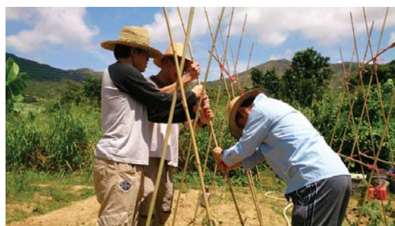
▼ Team effort of setting trellis guests

A farming land at Tuen Mun was leased to service users from different rehabilitation units to experience a natural way of life through farming activities and appreciation of the beauty of nature. Farming activities matched perfectly with the training programmes on “Life Education” which was specially designed for the service users to understand the life cycle of “beings”.