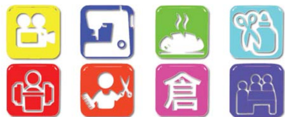
The trade skills taught in the project

To enrich the life of young people who received drug treatment at Caritas Wong Yiu Nam Centre, this three-year project was started in June 2013 and was supported by the Beat Drugs Fund Association. Employment orientation, job skills training, apprenticeships as well as counselling support were provided to the boys under treatment, in order to learn skills and build up their own career.