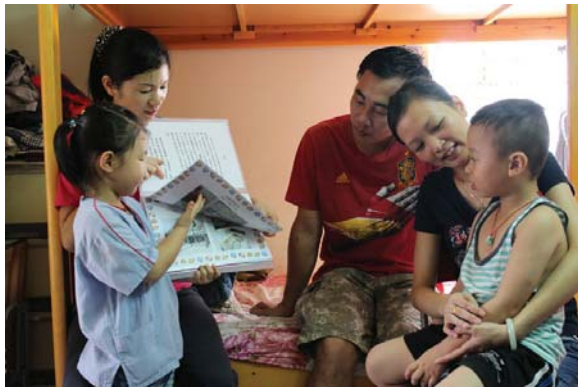
Home visit by children

With the Home-School Co-operation Grants in the amount of $260,886 supported by the Committee on Home-School Co-operation, Education Bureau, various home-school cooperation programmes and joint school projects were organized. During the period, a campaign on “Love and Hope – Building a Caring Community” was launched.