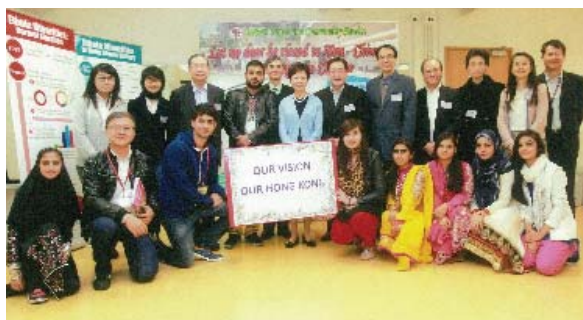
▼ Youth of ethnic minorities submitted their vision to Mrs Carrie Lam Cheng Yuet Ngor, Chief Secretary for Administration, HKSAR

Another effective programme “Hong Kong for All: Vision 2020” was co-organized with the Equal Opportunities Commission in celebration of the International Day for the Elimination of Racial Discrimination on 16 March 2014. Through the programme, the public was encouraged to envision racial inclusion in Hong Kong.