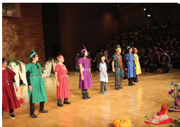
Participatory Drama on “Love in the Service of Hope”

To celebrate the 60th Anniversary of Caritas – Hong Kong, a drama was performed by more than 20 service users of different age groups (from 6 to 80) at the Hong Kong Academy for Performing Arts on 14 July 2013 with the theme “Love in the Service of Hope”. Around 130 service users including the elderly people were recruited as drummers and supporting actors / actresses. They collaborated with 600 participants from all services to make the participatory drama a success. All the service users enjoyed the performance and interaction.