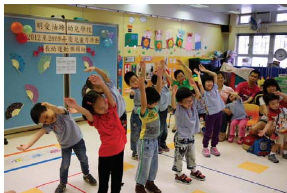
Children demonstrated exercises to their grandparents