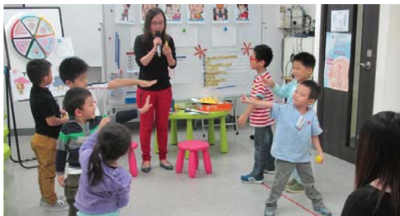
Collaboration skills trained through games