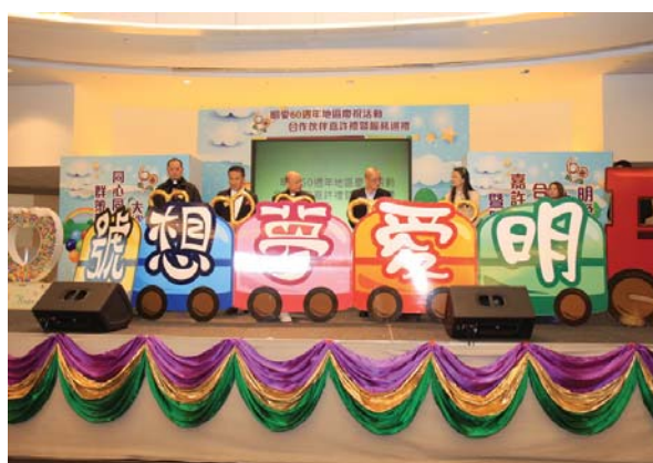
▲ Recognition ceremony for stakeholders cum services pilgrimage in celebration of the 60th Anniversary of Caritas

In celebration of the 60th Anniversary of Caritas - Hong Kong, Social Work Services units of Tsuen Wan / Kwai Tsing / Lantau District had jointly organized a cross-district programme to express Caritas appreciation to the stakeholders and partners. The event was held on 14 December 2013 and the programme included exhibition of winning entries in a drawing competition, game booths and performance by service users.