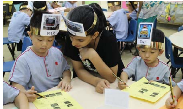
Shared Reading Campaign by secondary students

Programmes organized by school social workers