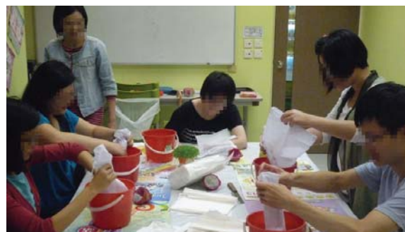
▼ Creative planting of pitaya seed in horticulture therapy group

were served. Jockey Club Early Psychosis Project continued to provide community group service for caregivers, the group members learnt to understand with empathy the feeling and needs of their family members with mental illness.