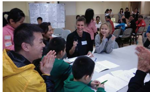
Participants and parishioners played ice breaking game happily