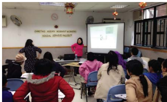
▼ Seminar about self massage and menopause

workers' groups to promote labour rights in Hong Kong and to strive for improving the unfavourable policies for foreign domestic helpers. Various supportive programmes were also launched, such as language programme, orientation programme, stress management course, health concern day and women's seminar.