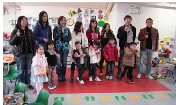
A parent-child volunteer class