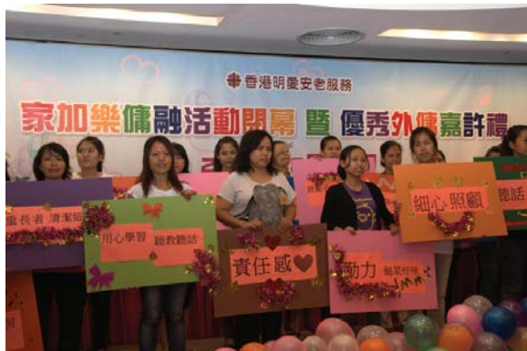
Domestic helpers were excited to get the awards recommended by their employers

domestic helpers and 531 carers participated in these activities. The Closing Ceremony cum Outstanding Foreign Domestic Helper Award Ceremony was held on 10 August 2013 with the participation of 150 elders and 35 foreign domestic helpers. The programme included an award presentation, photos taking plus photo frames making and games playing.