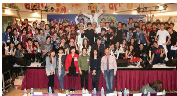
▼ A group photo of participants and guests

A total of 34 teams and 216 young people recruited from the youth service units joined the competition. The champion team of Advanced Level was nominated to enter in the Metro Street Dance Competition in Taiwan. A book was published to consolidate the participants' experiences and achievements. The book also transmitted positive and encouraging messages to the public.