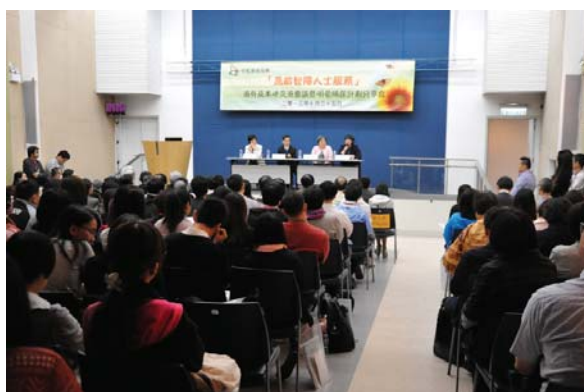
▼ Sharing of overseas speakers