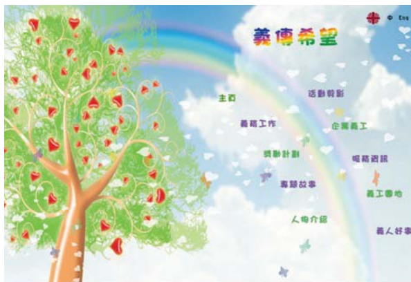
e-Volunteer System was set up to promote volunteerism

Two new online systems, namely e-Staff Training System and e-Volunteer System, had been launched. The former provided an online platform for staff to access to staff development programme information and for data collection. Both the registration and the evaluation of training programmes can thus be conducted in a more systematic and effective manner. The latter aimed to promote volunteerism by online registration of both individual and corporate volunteers, as well as publicity of voluntary service information and stories of the volunteers.