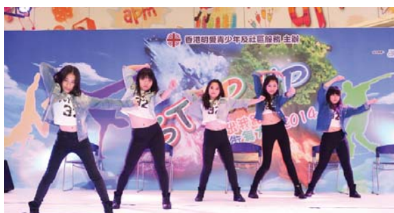
▼ Jazz dancing on stage