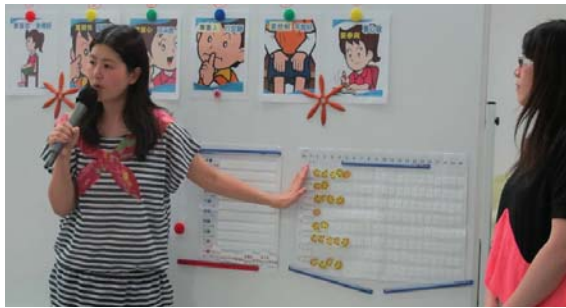
Effective behaviour management system in action