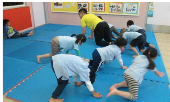
Children Group - Dancing Therapy