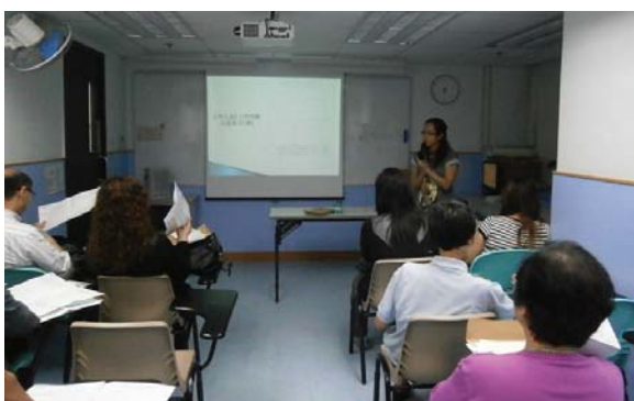
A talk introducing community resources was conducted by Caritas Labour Development Project