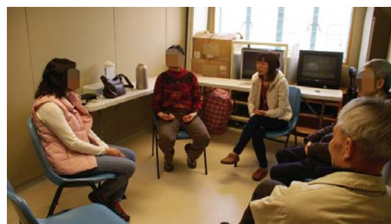
▼ Mutual help group for caregivers