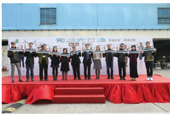
▼ The "Project PC Needy Reboot" was officially launched on 21 December 2013

The "Project PC Needy Reboot" was co-organized by Caritas Computer Workshop and RoadShow. It aimed to promote the computer recycling project through multi-media platforms that were sponsored by RoadShow. Famous artistes were engaged to appeal to the public for donation of used computers. Encouraging responses were received especially from corporations and business organizations. The programme also enabled people to know that the target beneficiaries of the project had been extended to elders, kindergarten students and the deprived families.