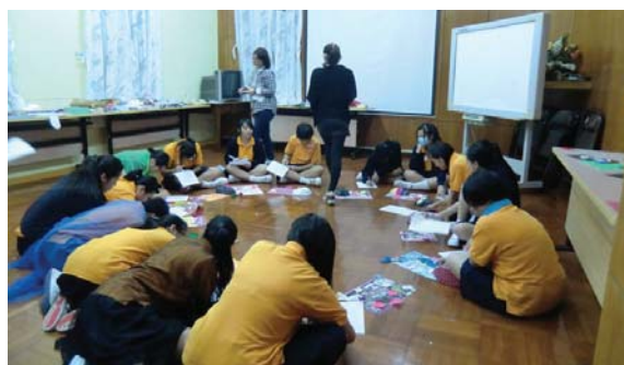
Students participated actively in group activities

During the year, some Creative Art Therapeutic Groups were organized in cooperation with Caritas Charrette Centre, which helped students to gain insights of life through experience of creativity.