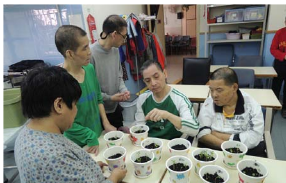
Service users were fertilizing the plant

Furthermore, the Board of Management of the Chinese Permanent Cemeteries granted a subsidy to Caritas Lok Fung Day Activity Centre to implement the programme “樂活人生路 – 智障人士生死教育計劃” in October 2013. Horticulture therapy was adopted to facilitate service users to understand the essence of life through various planting activities and community services.