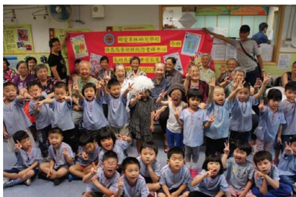
Visit to elderly centre

With an aim at cultivating children to live with love and especially to concern the elderly and the needy in the community, the nursery schools organized a series of activities, including visits to elderly centres, interviews with grandparents and parent-child drama performance etc. A campaign with the theme “Love and Harmony, Starting from Me!” was organized during the Children Month 2013.