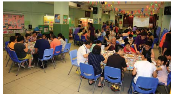
Along the meal, parishioners and participants shared life experiences with each other