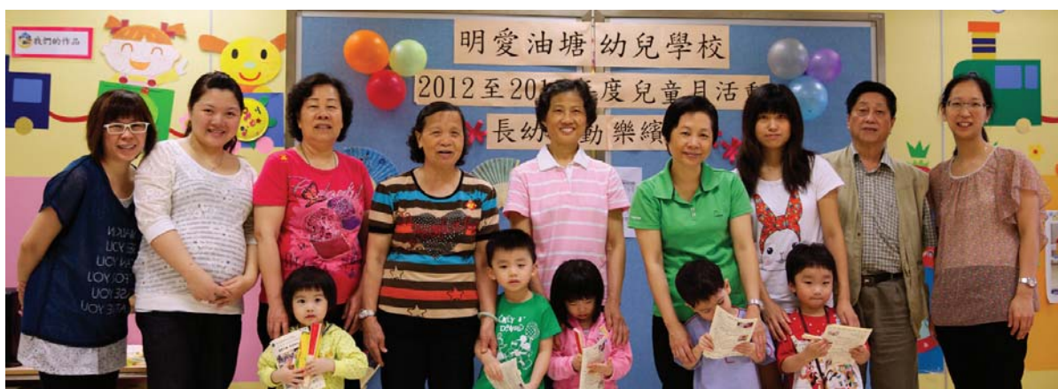
Children with their grandparents