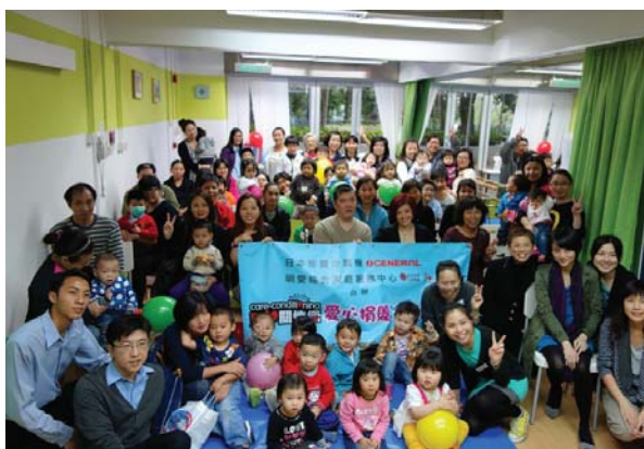
▲ A warm gathering organized by Alpha Appliances Limited for the deprived families after the Air-conditioners Donation Project