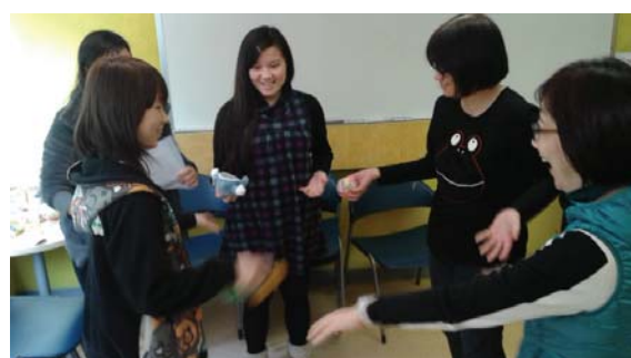
▼ Mentor-mentee programme

“Friendly Mothers Programme” was rendered by Project Hyacinth and attracted about 20 matured and enthusiastic women to join. After completion of the training, they became “friendly mothers” and help other young mothers to develop in the aspects they deemed appropriate.