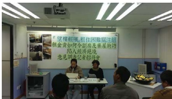
The Housing Concern Group held a press conference to arouse concerns for the hardship of tenants of the subdivided units

CDS assisted their service users to respond to the public consultation launched by the Long Term Housing Strategy Steering Committee (“Committee”). Concern groups were organized in Hung Shui Kiu and Lung Yeuk Tau for tenants of the subdivided units in squatter areas. Members of the concern groups advocated the use of idle government lands for building prefabrication components for transient housing for the families who are waiting for allocation of public housing flats. They held press conferences and wrote to the Committee to express their opinions.