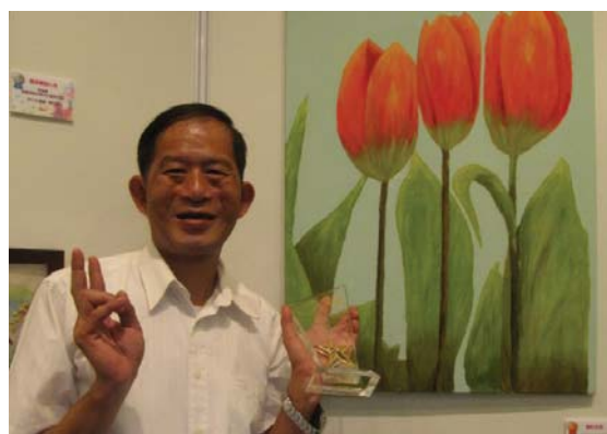
A moment of joy in receiving the gold medal

Service users of Caritas Joyous Link, Caritas Lok Him Day Activity Centre and Caritas Jockey Club Lai King Rehabilitation Centre participated in the “Let Them Shine Floral Competition” held by the Social Welfare Department in September 2013. Four of them won the gold medals, silver medal and certificate of merit. Their artworks were exhibited in the Hong Kong Central Library to enhance the public awareness on the art talent of persons with disabilities.