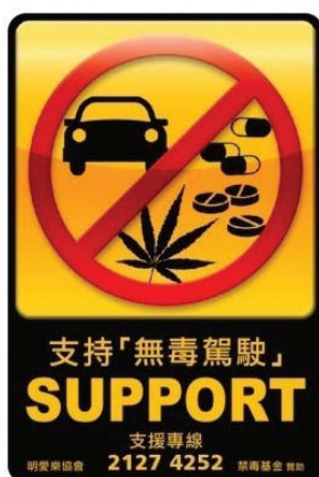
Publicity materials of “Say No to Drug Driving Project”