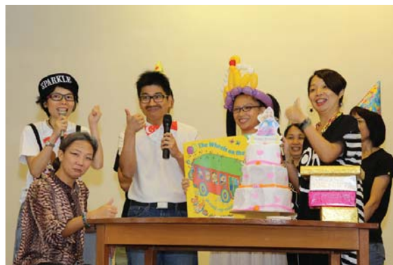
Parent-child drama performance