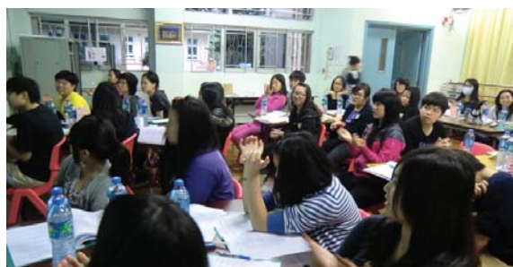
Participants learning health promotion exercise

The “Happy Home” Project celebrated its 5th Anniversary in 2014. The 4th Junior Happy Coach Training Course was held on 6 April 2013 with 40 students and staff members attended. Training courses would continue to be organized for students and staff to promote a happy life.