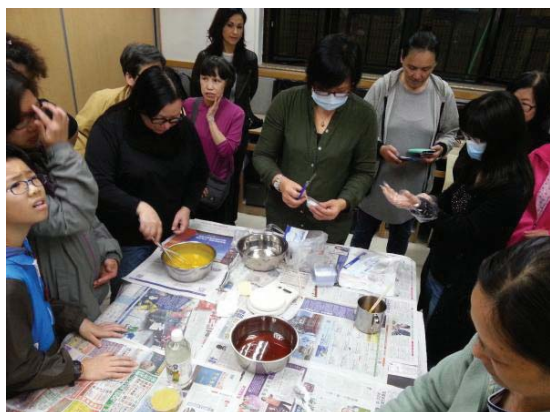
▼ The earth friendly home cleansing training sponsored by Women Helping Women Hong Kong Limited

Sponsored by Women Helping Women Hong Kong Limited, a Project “Women Helping Women in Support of Single Mothers 2014: A Collaboration with Caritas – Hong Kong” was implemented. It aimed at providing diversified services for single mothers to learn more new skills and connecting them to build up a mutual aid network in the community.