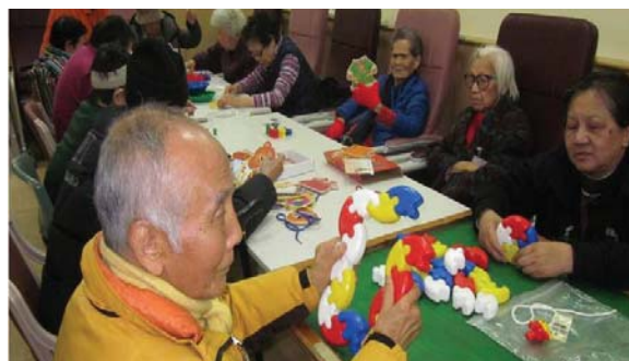
Training on eye-hand co-ordination

Caritas Jockey Club Integrated Day Services Centre and Caritas Mutual Help Project (Day Care Centre) were approved by the Social Welfare Department ("SWD") as the service provider of "The Pilot Scheme on Community Care Service Voucher for the Elderly" for 40 voucher users and 24 voucher users in a month respectively. The service commenced in September 2013. Up till the end of March 2014, the former Centre received 43 voucher users in Sha Tin and the latter Centre received 9 voucher users in Sham Shui Po.