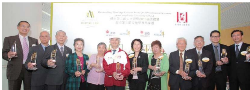
Awardees of the Outstanding Third Age Citizens Award