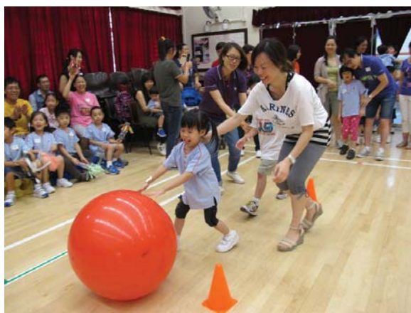
Parent-child Games Day