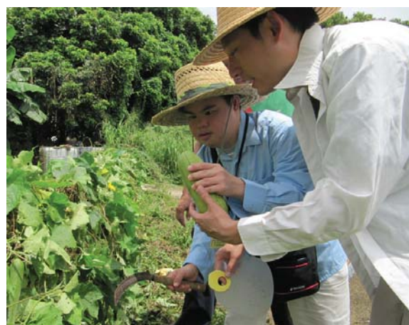
▼ Harvesting activity