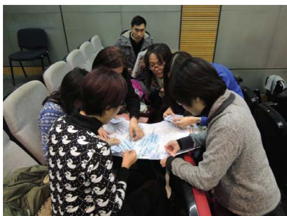
▼ The participants were experiencing language barrier through playing Urdu code game

Cultural Sensitivity Training had become well known in the promotion of racial acceptance and racial harmony. Cultural differences and difficulties of ethnic minorities were brought out through experiential programmes. It facilitated absorption of the ethnic minority perspectives into the public service mainstream.