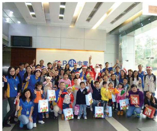
▲ Caritas Hong Kong and CLP collaborated together in serving deprived families