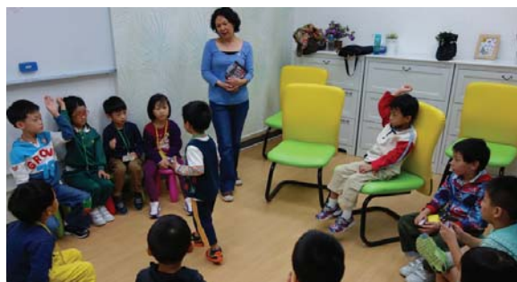
The character strength of “Care and Love” was built up from childhood