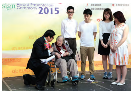
● One of the winners of the Outstanding Award

Two service users were awarded the Outstanding Award at the Youreable Fashion Design 2015 organised by the Troels H. Povlsen Care Apparel Centre of The Hong Kong Polytechnic University on 28 March 2015. One of the awardees also received the Best Presentation Silver Award.