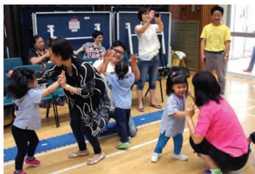
● The Parent-child Game Day to celebrate the 25th Anniversary