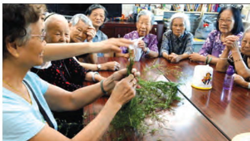
● Elder women recollected their past resilience of turning unprocessed herbs to medicine

In Lung Yuek Tau, elder indigenous women residents recollected the rice cropping history. Residents of the Hak Pai Chai recalled their past poultry farming activities and engaged enthusiastically in tracing the origin of the name of the area. The Hakka residents were involved in reviewing their history in village building and their efforts in forming land from slopes. They shared the resilience of their ancestors in meeting life demands by utilizing resources from the surrounding environment.