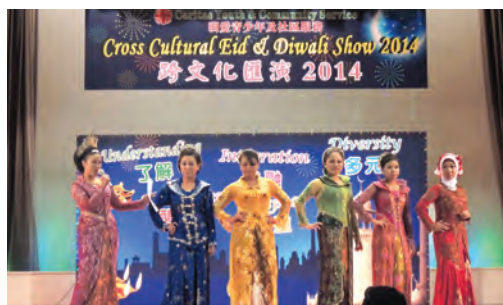
● Ladies presenting different national costume children

Cross Cultural Eid & Diwali Show 2014 was held on 18 October 2014 at Caritas Community Centre – Kowloon. It promoted harmony, integration, respect and mutual understanding in community. The stage performances were characterized with different ethnic cultures.