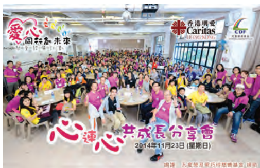
● “Heart to Heart Day Camp” at Sai Kung

The project formed groups and organized activities to promote the longer-term development of 112 children who are between 10 and 16 years old of disadvantaged background. The “Heart to Heart Day Camp” and the “Heart to Heart Lunar New Year Sharing Session” with Big Bowl Feast held on 23 November 2014 and 14 March 2015 respectively received good responses from the children, parents and mentors.