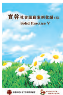
● “Solid Practice V”

A social work casebook “Solid Practice V”, which showcased 35 innovative and pioneering service projects launched during the past 10 years, was published.