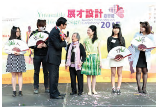
● Winner of the Best Presentation Silver Award