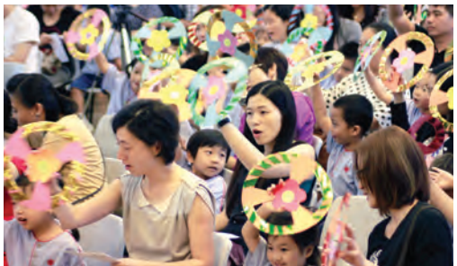
● Children and parents actively responded at the Parent-child Drama