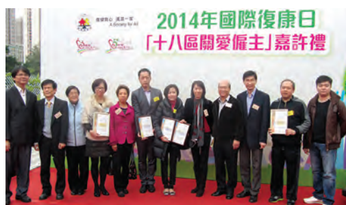
● Collaboration among Government, corporates and Caritas in promoting employment of people with disabilities

The Service was awarded the “Caring Employers” by The Hong Kong Joint Council for People with Disabilities to recognize our effort in employing people with disabilities.