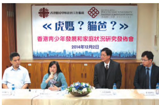
● Press conference of "Tiger mum? Cat dad?" held on 2 December 2014

The research was jointly conducted by Caritas School Social Work Services and Department of Applied Social Sciences of The Hong Kong Polytechnic University. The results confirmed that marital relationship of parents was positively correlated with the mental health of their children.