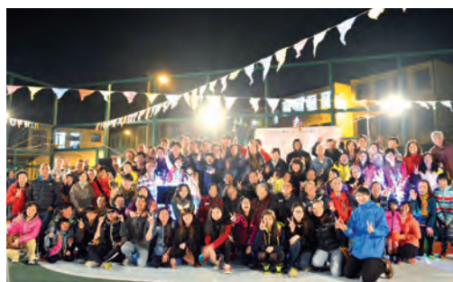
● 50th Anniversary Ceremony of St. Peter's Ming Shun Village

The St. Peter's Ming Shun Village in Sai Kung collaborated with Caritas in celebrating their 50th Anniversary. They recollected their memories on the neighbourliness, self-help housing, self-governing, childhood and community life. They also expressed their aspiration for further improving their village.