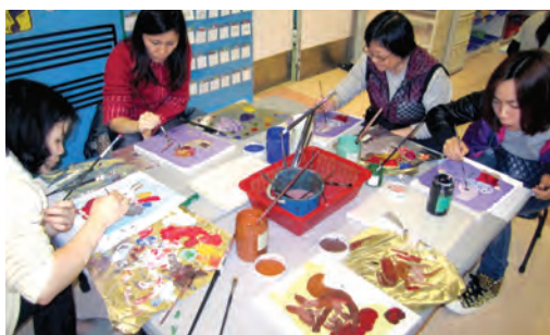
● A parent workshop 「畫出好心情」