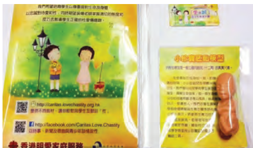
● Programme package