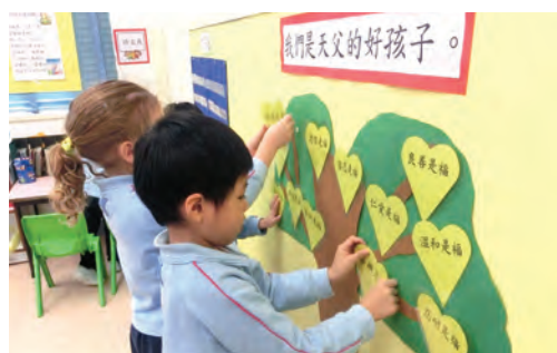
● Moral and religious education for young children