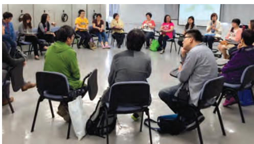
● Training for Peer Support Workers