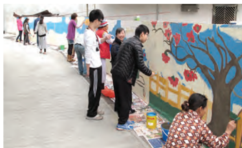
● Wall painting by the residents

Under the supervision of an artist, residents transformed the enclosed wall into a participatory platform in beautifying their community. Art became an ice breaking means and community building activities.