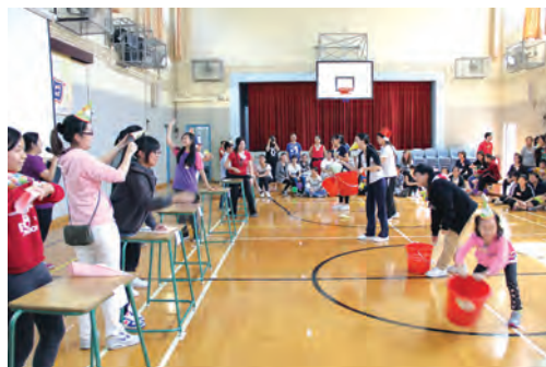
● Enjoyed parent-child games together

The “Family Day” is an annual function for all the girls and their family members to enjoy games, activities and barbecue together. The programme was started in 1984 and the 30th Anniversary was celebrated on 16 November 2014.