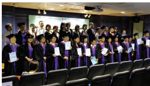
● Graduation ceremony of Peer Support Workers