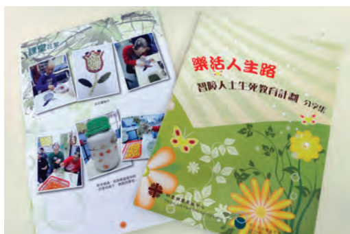
● The Booklet on Life and Death Education Project

A booklet “Enjoy the Beauty of Life, Feel the Power of Green – Life and Death Education for Persons with Intellectual Disabilities” was published in October 2014 after the successful completion of the Life and Death Education Project. The “Express my Heart through my Arts” was issued in March 2015 to collect the art works of our service users for public appreciation of their art talent and creativity.