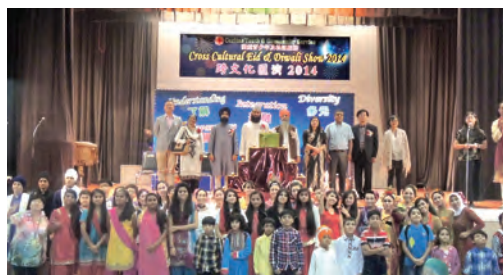
● Guests and Performers