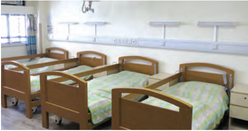
● New look of the Rehabilitation Hostel

To address the caring needs of old persons with intellectual disabilities, additional resources were allocated by the SWD to employ nursing staff and frontline care staff to implement the captioned programmes from February 2015 onwards. A total of 55 cases in the sheltered workshops, day activity centres and residential care homes would be selected to join the special activities after formal assessments.