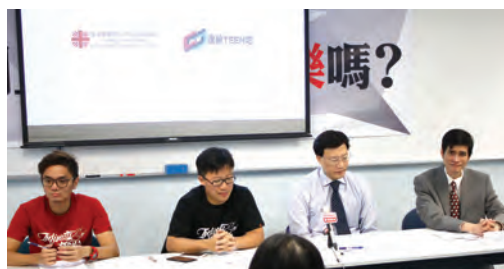
● “Are Cyber Youth Happy?” press conference

A study on the life satisfaction of cyber youth was conducted with The Chinese University of Hong Kong and City University of Hong Kong. Given the low life satisfaction of most cyber youth, the team integrated the elements of E-sport and social support into the group work for them.