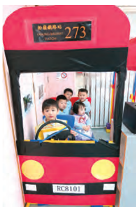
● Role-play of children - giving the seats to the needy

Caritas Nursery Schools – Kai Yau, Kennedy Town, Sha Tin and Zonta Club of Hong Kong had completed the school inspection conducted by EDB during the period. EDB commended the Schools' good practices on the promotion of moral education and language development of children, the attitude of sharing, creative writing of children and the focus on religious curriculum.