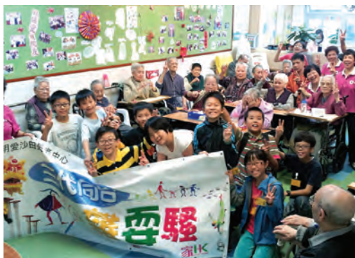
● Playing juggles with the children at an Aged Home