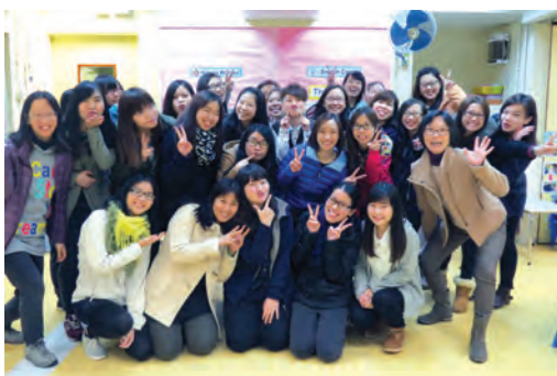
● Teachers training on Drama Education

With the training subsidy from the Social Welfare Department ("SWD"), a series of workshops and training courses to enhance the professional capacity of teachers and administrators was organized by the Service. The trainings included Risk Management, Rhythmic Movement Training, Drama Education and English Teaching for Children.