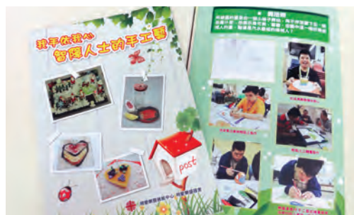
● The Booklet on collection of art works of persons with intellectual disabilities