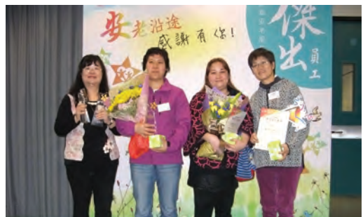
● Awardees of the 2nd Outstanding Staff at Elderly Services Award Ceremony

Two staff (a social worker and a home care worker) were awarded the Outstanding Award and another two staff (a rehabilitation worker and an enrolled nurse) were awarded the Excellent Award by The Elderly Services Association of Hong Kong and Hong Kong Employment Development Service Limited on 7 March 2015. The social worker also received the Brilliant Award for Experienced Staff.