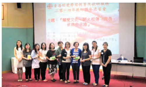
● Presentation of long service awards at the Annual Departmental Evaluation Seminar

The Annual Departmental Evaluation Seminar with the theme "Crises, Caress, Advancement and Spirituality, Caritas - Hong Kong into the Relational Future" was held on 17 July 2014 with 125 participants. Discussions on "Parent-school Collaboration" and "Professional Development" were conducted.