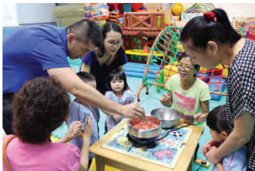
● Parents and children made fruit jam during the Children Month

With the Home-School Co-operation Grants in the amount of $264,879 supported by the Committee on Home-School Co-operation, Education Bureau (“EDB”), a series of activities with the theme “Love and Harmony” was organized during the Children Month 2014. In addition, a Joint-school Parent-child Interactive Drama “Love and Harmony” was performed in May 2014 with more than 800 children and parents participated.