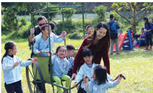
● An outdoor activity to enhance parent-child relationship