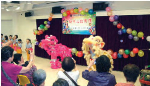
● Open House of Caritas Elderly Centre – Sha Tin at new premises

Caritas Elderly Centre – Sha Tin commenced services at the new base at Tai Wai Social Service Building on 23 May 2014. The drop-in rate and number of new members increased after reprovisioning of the Centre since the location of new base was easily accessible to elderly members than the old base.