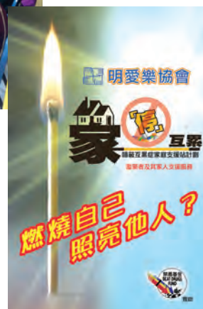
● The poster publicizing the services