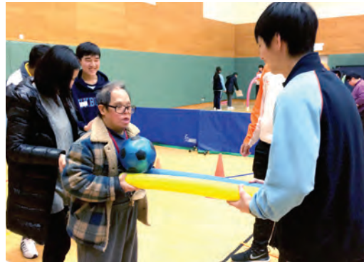
● Participation of fitness activity