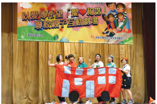
● “Love and Harmony” - Drama performed by teachers