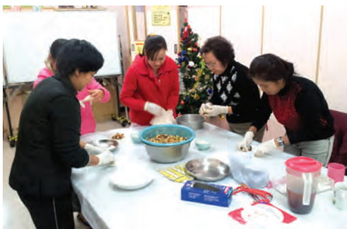
● Cooking traditional Chinese snacks

The “長幼耆藝樂傳承” programme organized by Caritas Elderly Centre – Sha Tin was awarded the 2013/2014 SWD Opportunities for the Elderly Project Territory-wide Best Project and the Best Project of Sha Tin district. A variety of programmes aimed at sharing of life wisdom and cultural talents among the elders with different target groups were held. Totally 1,356 people were served in this programme.