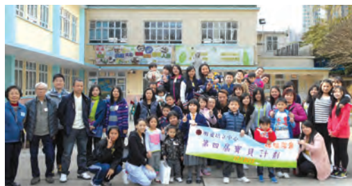
● Cheerful faces of the “4th Darling Project”

The “4th Darling Project” was held on 17 January 2015. It was a volunteer service programme financed by donations from staff or staff’s relatives, to invite underprivileged families in the community to the Hall for activities and barbecue.