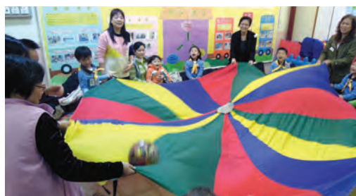
● Parent-child workshop 「笑出正能量」

To foster a positive parent-child relationship, to enable parents to have better understanding on children's growth and development as well as to support parents to face the challenges in nurturing the children, a series of school-based Parent Education Programmes and parent-child activities was organized. Collaboration with families and stationing school social services were continued in promoting the family values and engagement of parents in children's learning.