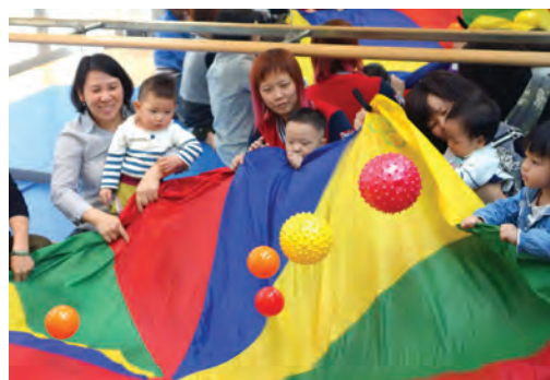
● Enjoying quality time in parent-child Play Land

The project, supported by the Simon K. Y. Lee Children's Fund, was started in five Caritas Integrated Family Service Centres to promote well-being of the toddlers and enhance parent-child bonding for low income families.