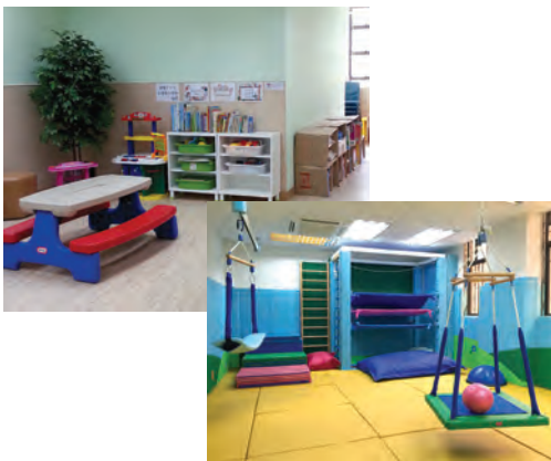
● New service base of Caritas Professional Support Services for Children with Special Needs

Caritas Professional Support Services for Children with Special Needs started operation at Caritas Kowloon Social Centre in late January 2015. The venue was well furnished with training and activity rooms, special facilities such as sensory integration room to serve children with special needs including autism, attention deficit and hyperactivity disorder, etc.