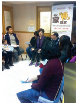
● A talk for family members of hidden drug abusers

The project, funded by the Beat Drugs Fund, aimed to engage family members of hidden drug abusers, so that they could in turn motivate the abusers for treatment.