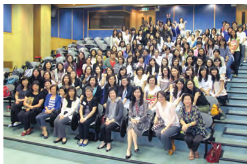
● "Working SMART as a TEAM"