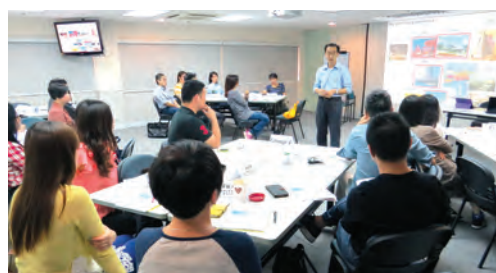
● Executive Development Programme

With the support of the Social Welfare Development Fund, 174 training programmes were organized during the year, of which 6 were overseas study visits and 10 were leadership and management skills development programmes for mid-level staff. A total attendance of 3,832 was recorded. Besides, sponsorship was granted to six staff members to attend fieldwork placement.