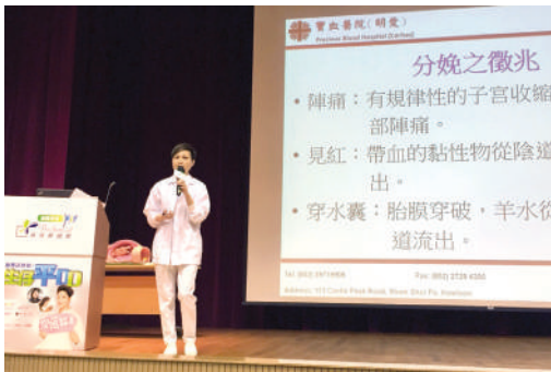
● Education Talk for Expectant Mothers at the local community hall

The Obstetric and Gynecology Department jointly with the local community networks held antenatal talks in various districts to provide antenatal education to the expectant mothers. It would help to promote the maternity service of the hospital to the local mothers in Hong Kong.