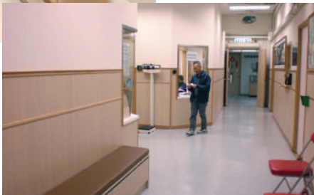
● Spacious waiting hall for dental and medical patients