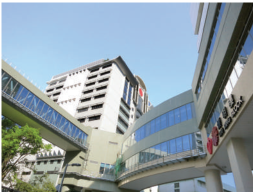
● Wai Ming Block

The new ambulatory, rehabilitation and support service building - Wai Ming Block has been in operation since March 2014. The new 12-storey building accommodates Out-patients Department, Ophthalmic Centre, Pharmacy, Geriatric Day Hospital, Day Care Centre, Day Surgery Centre, Integrated Rehabilitation Centre, Palliative Care Centre and Rehabilitation wards.