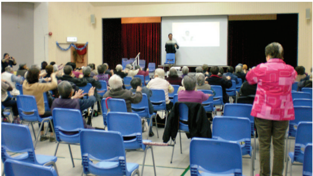
● Elderly followed the exercise presented by the Registered Physiotherapist