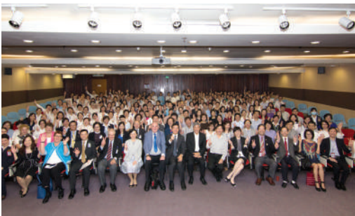
● Presentation ceremony of ACHS award

The hospital had successfully completed the Organization Wide Survey of the Australian Council of Healthcare Standards ("ACHS") conducted from July to August 2014. It was awarded a four-year full accreditation again. Four criteria had achieved Extensive Achievement.