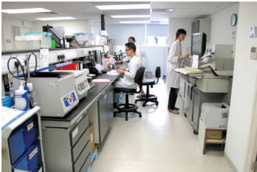
● The new Laboratory Office

The Laboratory Information System Management System was developed. The enhanced laboratory service would come anew in mid-2015.