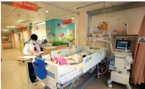
● Additional beds at Paediatric Ward

Three additional paediatric beds for centralized care of chronic ventilator assisted children were established in the 4th quarter of 2014.