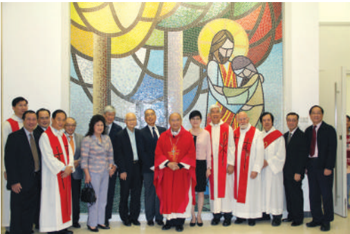
● Thanksgiving mass for the 50th Anniversary officiated by Most Rev Michael M.C. Yeung

The hospital celebrated its 50th anniversary in 2014. A series of celebration activities was launched, including thanksgiving mass, gala dinner, open day, publication of newspaper supplement, photo competition, etc.