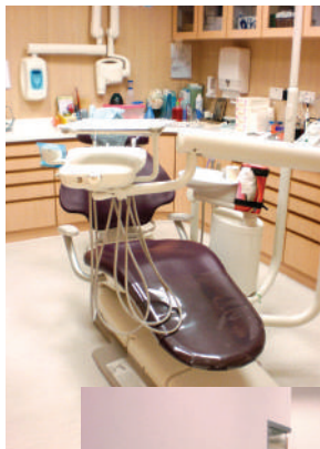
● New dental chair installed at the clinic

After the two-month renovation works for facilities improvement, Caritas Ngau Tau Kok Clinic was re-opened in September 2014. The new refurbished facilities provide better environment to the patients of the community.