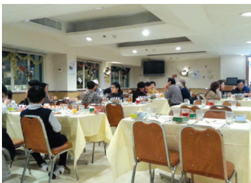
● Caritas Café was back to business in April 2014