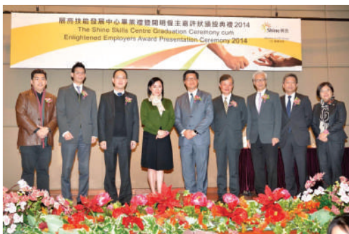
● The Enlightened Employers Award Presentation Ceremony 2014

The Shine Skills Centre of the Vocational Training Council presented the Enlightened Employers Award to the Caritas Restaurant for providing employment opportunity to the disabled.