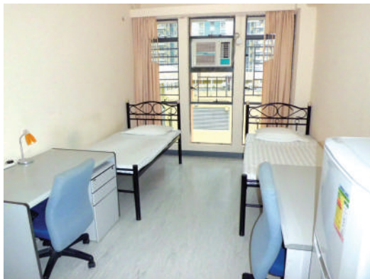
● Caritas Ngau Tau Kok Hostel for male students