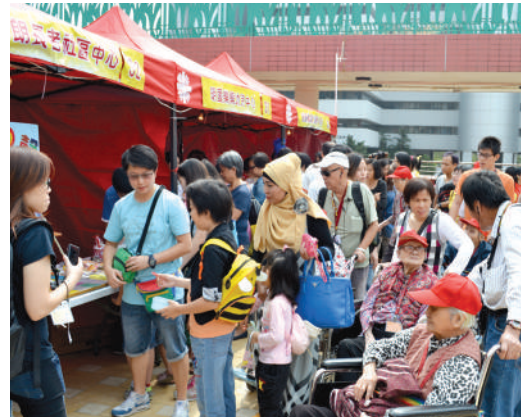
● People from all walks of life made bargains at Caritas Bazaar

Furthermore, LSCs liaised with parishes in the seasonal sale of Christmas and New Year cookies produced by Caritas La Vie Bakery, the service aim of which is to provide more job opportunities for people with disabilities.