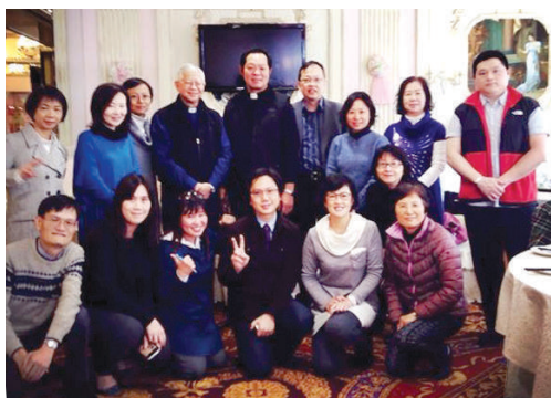
● Lunch gathering with parish priests and Caritas staff before a Caritas visit

Moreover, visits to Caritas service units and social gatherings with parish priests had been arranged to strengthen mutual understanding and support.