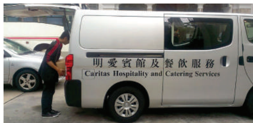
● New 6-seater van of Caritas Bianchi Lodge

A new 6-seater van for Caritas Bianchi Lodge and a new 23-seater bus for Caritas Oswald Cheung International House commenced services in December 2014 and March 2015 respectively. This would improve the delivery arrangement for outside catering service and also provide more comfortable shuttle service.