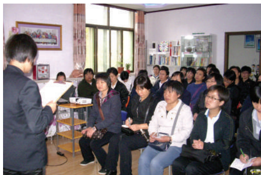
● Project management course in Hebei province

In view of the rapid development of the social work services in Mainland China and to broaden the exposure of the religious women who are working in different kinds of social services, allowance is provided for exposure visits, seminars and short-term training courses. The feedback from the participants of various activities, such as “China Charities Fair 2014”, “Workshop on Early Education in China” was very positive. Their awareness in providing better service has been raised.