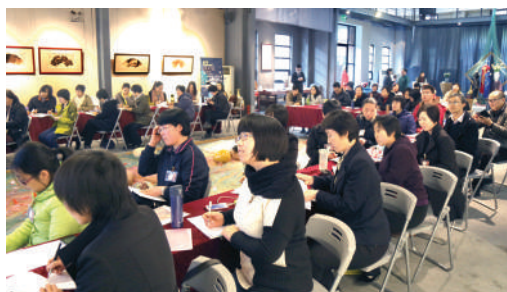
● Homecare Elderly Service Workshop in Guangzhou city