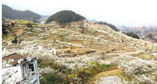
● The infertile land has turned into a plum garden

Nothing is better than helping the beneficiaries to be self-reliant and self-sufficient. With the funding assistance from Caritas, Wanzhou Social Service Centre helped 30 farming households in Fenshui town, Wanzhou district, Chongqing city to raise cattle for their living and set up a credit union among themselves. In two years' time, they had not only increased their income, but also achieved sustainable growth and a much improved living condition. Cattle waste was used as fertilizer for the planting of plum trees, and the grass growing around the plum trees were served as animal feed. Regular training on management, techniques for farming and ranching was also provided to the farmers. All these measures helped to boost the local agricultural industry.