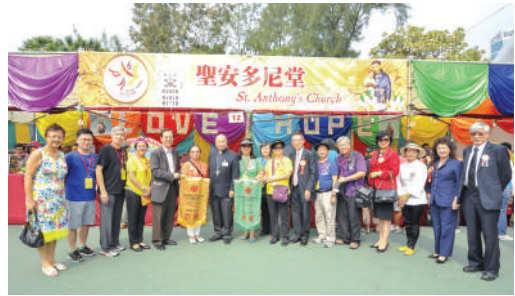
● Caritas Bazaar at Victoria Park, Causeway Bay