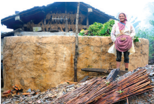
● A Yunnan village woman stands joyfully next to her newly built water cellar