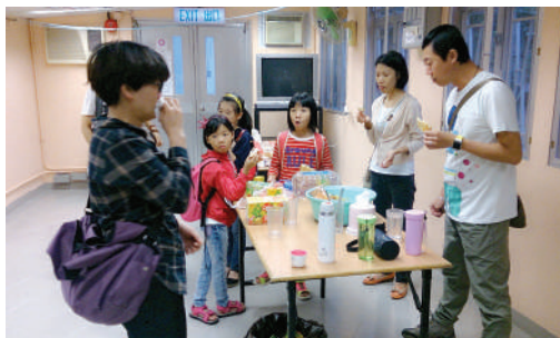
● Campers inside Caritas Tsing Yi Activity Centre