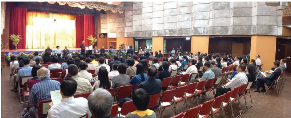
● The Closing Ceremony of Caritas fundraising campaign held at Caine Road Community Hall

With targeted promotions in 2014/2015, the Caritas Tsing Yi Activity Centre saw a substantial rise in the usage, receiving 786 visitors from 23 organizations. Eight parishes / diocesan organizations and fifteen voluntary organizations used the Centre for retreats, meetings and barbeque purposes. The Centre will continue to reach out to a wider network in the community to increase its usage rate.