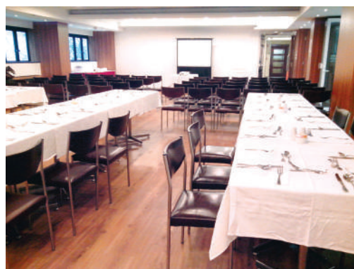
● Seminar at Caritas Bianchi Lodge Restaurant

Restaurants were upgraded by renovation and re-installation of kitchen equipment. Renovation projects at the Caritas Café and the Caritas Bianchi Lodge Restaurant were completed in April 2014 and November 2014 respectively. Business was picking up progressively.