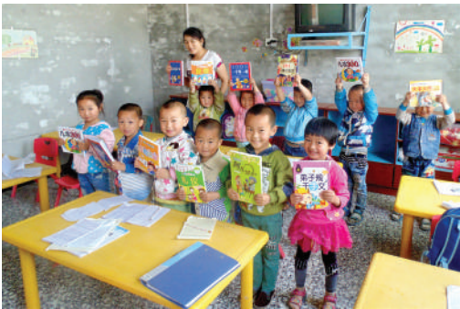
● Students holding their new books with joy at Shaanxi Tianai Kindergarten