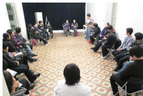
● Group sharing at the end of Guangdong project management course