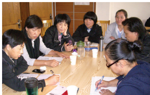
● Small group discussion in Hebei project management course