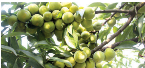
● New breeding techniques are used to grow plums in Chongqing farming project