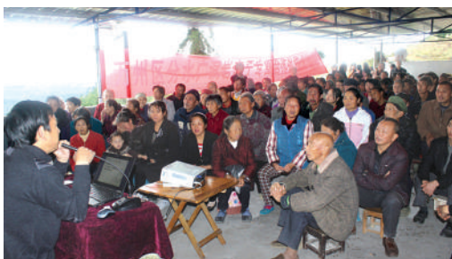
● Training on management and techniques for farming and ranching

In collaboration with the Institute of Civil Society, Guangzhou Sun Yat-sen University, a workshop on Homecare Elderly Service was organized in January 2015 for 35 workers from the elderly services all over China, including 20 religious women. Internship will be arranged in the advanced service centres later this year.