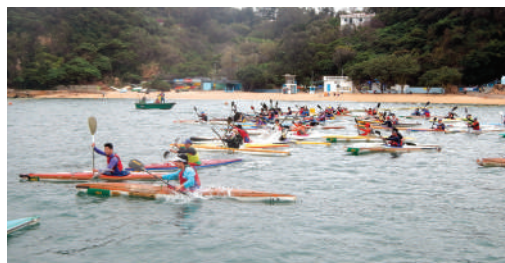
● The 32nd Cheung Chau Island Canoe Race

The 32nd Cheung Chau Island Canoe Race was successfully held on 1 March 2015 with 154 persons participated in various sporting events. Islands District Council Members were invited as the Guests of Honor and for prizes presentation.