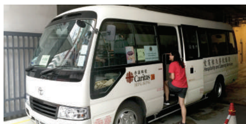
● New 23-seater bus of Caritas Oswald Cheung International House