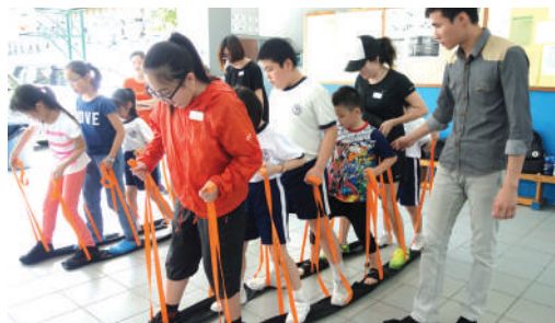
● A collaboration programme with three primary schools and a parish in Tsuen Wan

LSCs facilitated in promoting collaborative activities among Caritas units, parishes, Catholic schools / kindergartens and the diocesan organizations. Examples were implementation of an annual parent-child programme targeted at families of several primary schools in the New Territories, provision of assistance to parishes relating to Mission Sunday at the diocesan level, promotion of the future Catholic university at Tseung Kwan O, introduction of new Caritas services, rendering of janitorial services for parishes, as well as involvement of catechists, parishioners and students in charitable events such as bazaar, charity walk, etc.