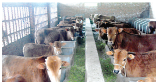
● Cattle rearing project in Wanzhou district, Chongqing city