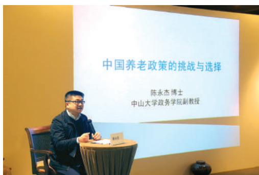
● Talk on the elderly care policy in the Mainland