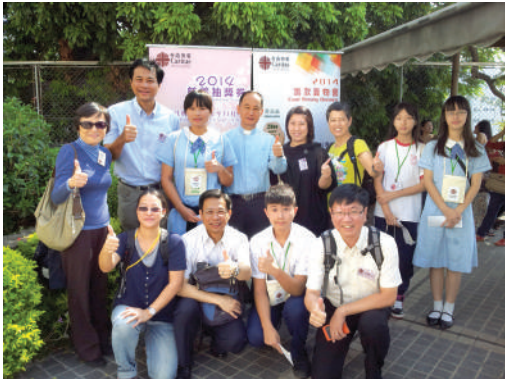
● Deputy Chief Executive with Caritas staff and volunteers at SS. Peter and Paul Parish in promoting sale of raffle tickets