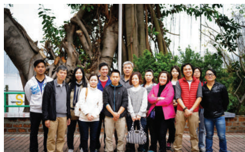
● A group photo was taken at the Salvation Army – Ma Wan Youth Camp

Two training activities were organized: an overseas trip to Yangchun in China from 2 March 2015 to 3 March 2015 and a local trip to Noah's Ark Hong Kong – Solar Tower Camp and The Salvation Army – Ma Wan Youth Camp at Ma Wan Island on 13 March 2015. Exploring hospitality services, sharing experience, exchanging views on the development of the camp industry as well as on team buildings were the focus of the activities.