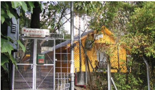
● Caritas Tsing Yi Activity Centre

With targeted promotions in 2014/2015, the Caritas Tsing Yi Activity Centre saw a substantial rise in the usage, receiving 786 visitors from 23 organizations. Eight parishes / diocesan organizations and fifteen voluntary organizations used the Centre for retreats, meetings and barbeque purposes. The Centre will continue to reach out to a wider network in the community to increase its usage rate.