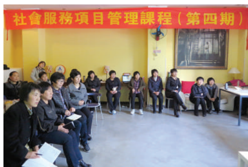
● Project management course in Guangdong province