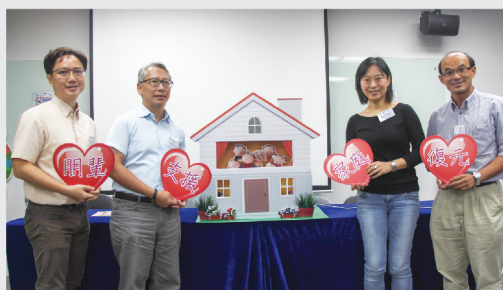
• Advisors of Peers and Family Peers Project attended the kick off ceremony

This was a pilot project and was funded by HSBC via the Community Chest of Hong Kong. It aimed at assisting individuals or families who have family members being newly identified to have mental illness by mobilizing trained peers or family peers with life experience on mental illness.