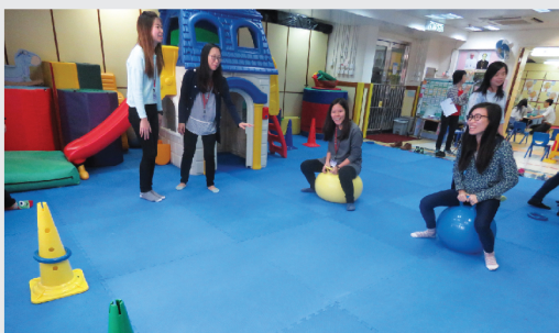
• Sensory Integration Workshop