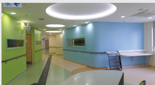
• Supported Hostel