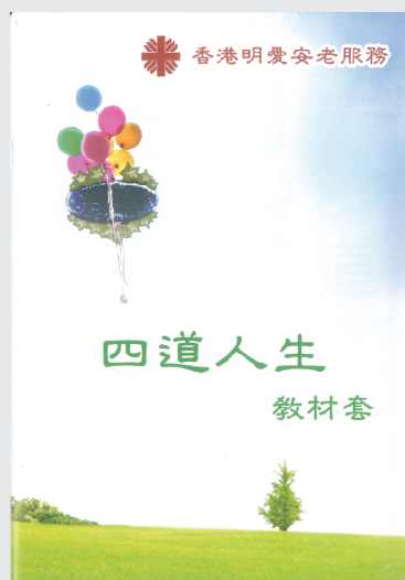
• The “Four Ways of Life” training kit