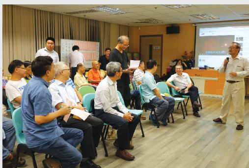
• Men's group gathering