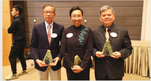
• Three awardees of the 4th Outstanding Third Age Citizens Award

One member from each of Caritas Cheng Shing Fung District Elderly Centre (Sham Shui Po), Caritas Elderly Centre – Sha Tin and Caritas Elderly Centre – Lai Kok received the Outstanding Third Age Citizens Award on 23 April 2015. Another member from Caritas Elderly Centre – Ngau Tau Kok was awarded the merit prize. This biennially campaign was jointly organized by the HK Electric and The Hong Kong Council of Social Service which aims to recognize those people who have a passion to enjoy a fruitful third age through continuous learning, passing on their experiences and knowledge to others.