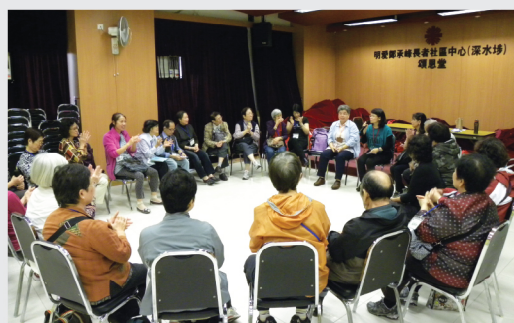
• A training on “Four Ways of Life” for volunteers

“Four Ways of Life” refers to “Love”, “Gratitude”, “Apology” and “Farewell”. The training kit was published in July 2015. It can be used for individual or group training of volunteers, elders and carers on life and death education.