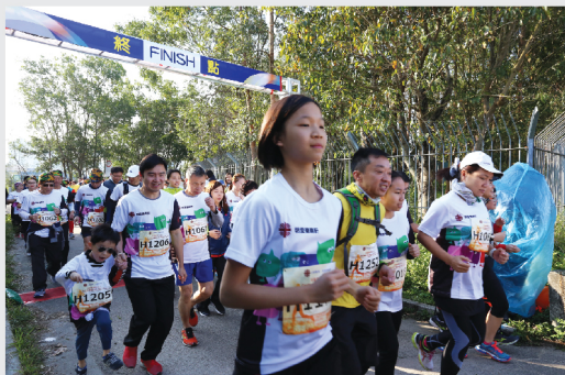
• The Caritas Wellness Run

The Run was organized by Caritas Wellness Link – North District to promote physical fitness for positive mood and awareness on mental health. It was held on 28 February 2016 at Sheung Shui near Ng Tung Riverfront and attracted around 1,000 runners.