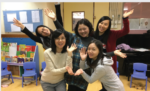
• Orff Music Workshop