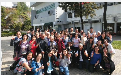
• Participants of the Research on Users’ Participation