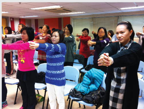
• Participants practiced 3-zero exercise

With the support of The Hong Kong Jockey Club Charities Trust, the Project was launched in eight Caritas Integrated Family Service Centres in collaboration with the School of Public Health, The University of Hong Kong. This research-based project aimed at promoting family holistic health and encouraging family interaction through 3-zero exercise (zero-time, zero-money and zero-equipment), healthy diet and positive life style.