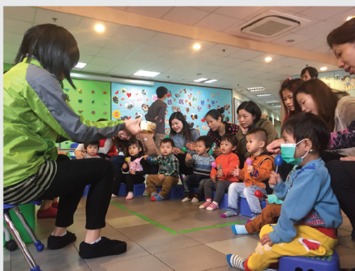
• Participants enjoying the activities