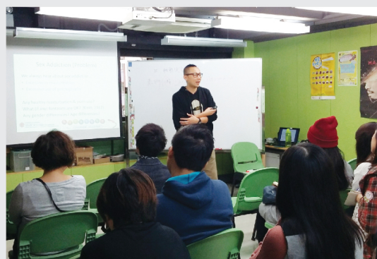
• “What is healthy sex?” training workshop

The project, supported by Lee Hysan Foundation, aimed at providing comprehensive sex knowledge for youth. The activities included sex education, individual counselling, developmental programmes, supportive services for youth and parents. In the year 2015/2016, 83 talks on sex education for over 6,700 youth, over 800 counselling sessions for 100 cases, 43 developmental programmes, and 8 supportive groups for youth and parents were conducted.