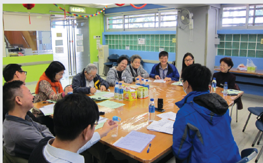
• Group discussion on Users’ Participation

The 1st research provided useful practice framework and techniques on the communication and negotiation in group process for promoting Users’ Participation in service management. The 2nd research recommended constructive strategies on the enhancements of daily casework practices for social workers in District Elderly Centre and Elderly Centre.