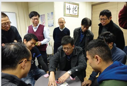
• Men in the board game class

This three-year project has been launched in February 2016 with the support of The Hong Kong Jockey Club Charities Trust. It aimed at providing multi-level support services for men aged between 18 and 55 with social, emotional or relationship difficulties.