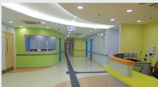
• Day Activity Centre cum Hostel

Caritas Cheer Home commenced service operation in mid-February 2016. The Home consists of a day activity centre cum hostel and a supported hostel serving altogether 70 adults with different levels of intellectual disabilities.