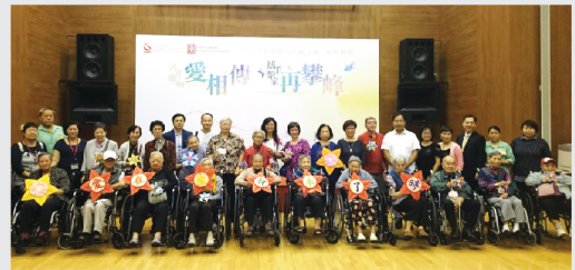
• Residents and staff of Caritas Harold H.W. Lee Care and Attention Home attending the Award Presentation Ceremony

The life education programme “愛在生命未了時” managed by Caritas Harold H.W. Lee Care and Attention Home was awarded the Best Residential Service Award. Besides, the dementia programme “愛家繫時計劃” proposed by Caritas District Elderly Centre – Yuen Long (Tin Chak Centre) received the Best Project of Yuen Long District and was the 1st runner-up in the Territory-wide Best Project.