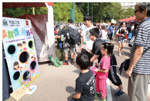
• The six Caritas Bazaars attracted thousands of visitors who returned home from a fruitful journey