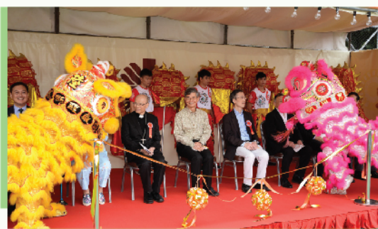
• The lion dance team greeted the officiating guests at the opening ceremony of the Hong Kong Bazaar

Appeals for support and running bazaar stalls made to the parishes, schools and associations were met by encouraging responses. About 480 units, including parishes, mass centres, schools, organizations and Caritas service units participated in this year's Campaign. The six bazaars held in Hong Kong, Tuen Mun, Kowloon, Cheung Chau, Sha Tin and Tsuen Wan were operated with the assistance of about 15,000 enthusiastic volunteers. The official opening of the Hong Kong Bazaar was officiated by Dr the Hon Law Chi-kwong, GBS, JP, Secretary for Labour and Welfare while that of the Kowloon Bazaar was officiated by the Hon Kevin Yeung Yun-hung, JP, Secretary for Education. The other four bazaars were opened by local dignitaries.