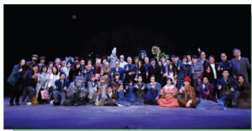
• Searching for dreams and hopes, Enjoying warmth and good cheer - Members of "Friends of Caritas" and guests joined the Charity Musical "SCROOGR!" to celebrate with love and laughter around Christmas time

The Industrial & Commercial Bank of China (Asia) has taken up the chairmanship of the Campaign for 19 consecutive years. This year, the total amount raised from the Campaign came to a record high of $31.96 million, which included $8.02 million from the six bazaars and the first ever 2018 Caritas Charity Fun Fair, $13.14 million from the sale of raffle tickets and $10.80 million from the Friends of Caritas (through fundraising activities like Charity TV Show, Charity Musical and Charity Golf Day), patrons of the Campaign, corporate donors and individual benefactors.