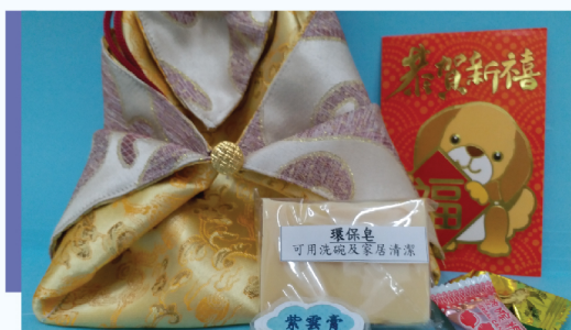
• Handmade products prepared by group members