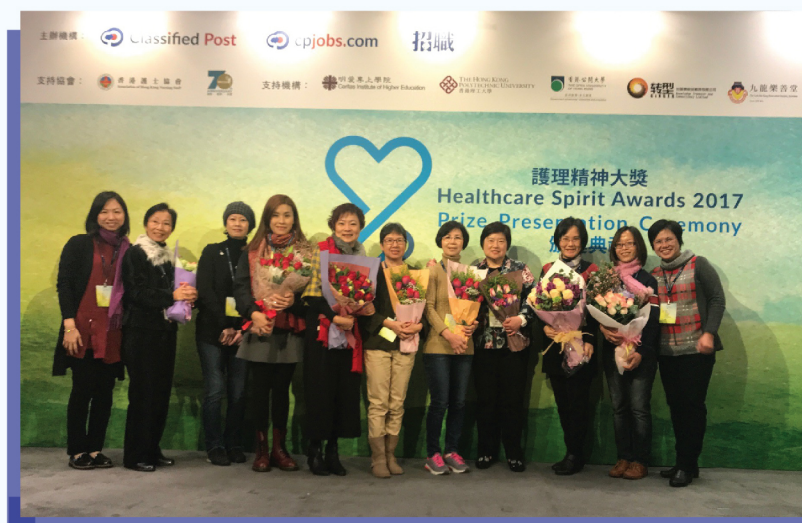
• The winners of Healthcare Spirit Awards 2017