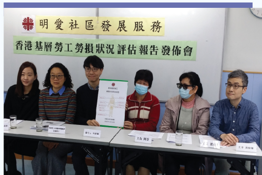
• Press conference was announced on 12 February 2018