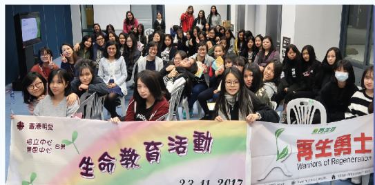
• Joint programme on life education organized by Caritas Pelletier Hall and Caritas Mother Teresa Hall