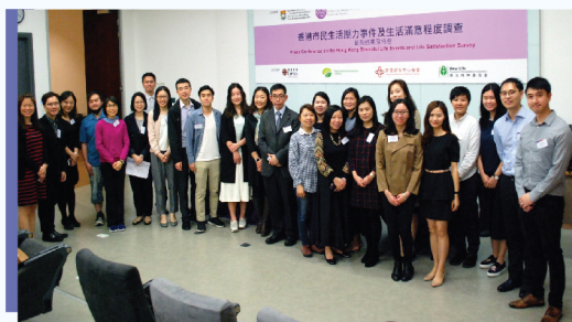
• Press conference on mental health survey

This three-year Project, as funded by the Hong Kong Jockey Club Charities Trust, commenced service in March 2018. The Project constructs a comprehensive gender-specific system to enhance early detection of grassroots women with low incomes who are at risk of mental disorders and to offer preventative intervention. It aims to improve mental health outcomes by developing a preventative intervention model. Components of the project cover screening, intervention, research, evidence based evaluation, training and public awareness promotion.