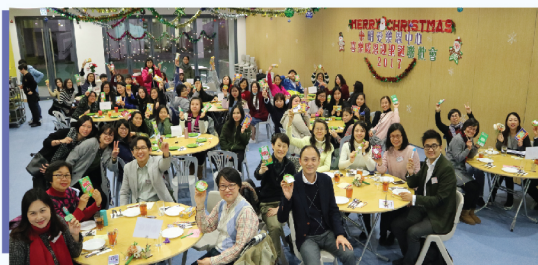
• The first Christmas Party at Caritas Mother Teresa Hall