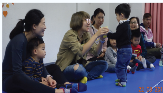
• Kid served his mother as action of love