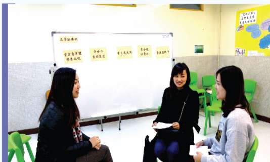
• Mentorship training programme

This three-year project was funded by the Community Chest of Hong Kong to support parents with autistic spectrum disorders children who are not being identified in the community and are deprived of existing service. Tailor-made service programmes with therapeutic approach were provided for parents to reduce their parental stress and emotional problems so as to enhance their caring competence and the functioning of the whole family.