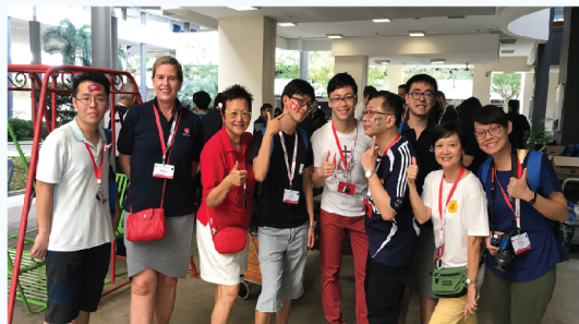
• The participants from the Service

The Summer Camp was organized in Singapore from 8 June 2017 to 11 June 2017 by Order of Malta (Singapore). Three disabled service users and three carers from the Service joined the exciting and challenging activities with 162 participants from other pan pacific countries. All shared the moments of joy and enjoyed lively cultural exchange.