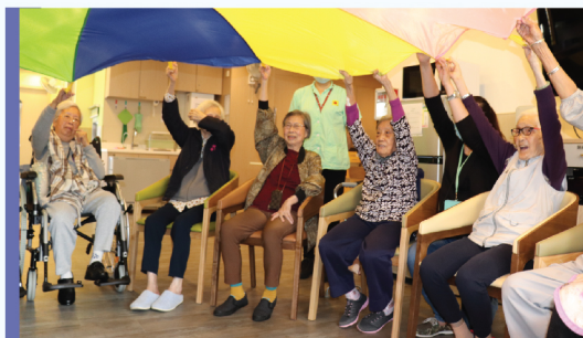
• Residents participating in group activities organized by the Home

The Home commenced operation on 11 December 2017 with 12 residents transferred from Caritas Lung Tin Home. Caritas Lung Tin Home ceased operation with effect from 12 December 2017. Totally 107 residents and 45 members were admitted to the Home and the Day Care Centre respectively as at end of March 2018.