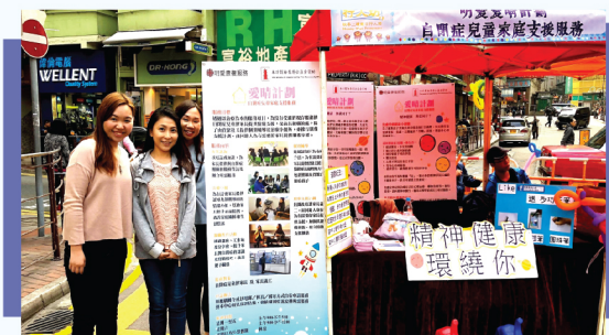
• Public education programme