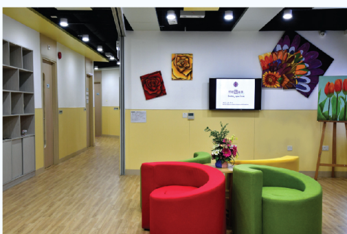
• New look of the District Support Centre