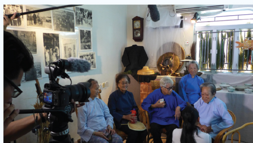
• Women at Lung Yeuk Tau shared their stories

With the support of the Lord Wilson Heritage Trust, Caritas Lung Yeuk Tau Community Development Project has produced a song book and an album to record the songs, the rhymes and the stories of the Lung Yeuk Tau's women who were married under Chinese traditional customs.