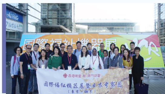
• Joining the event together with Caritas Macau

A total of 15 staff members from Social Work Services including 7 staff members of the Service had attended the Exhibition cum Study Visit at Tokyo, Japan from 26 September 2017 to 30 September 2017. Besides attending the exhibition on modernized home care equipments, the study tour to the local Japanese rehabilitation organization also provided an opportunity for the participants to enhance their horizon on rehabilitation service practices.