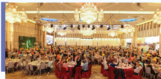
• A grand scene in touch with the hearts of each other