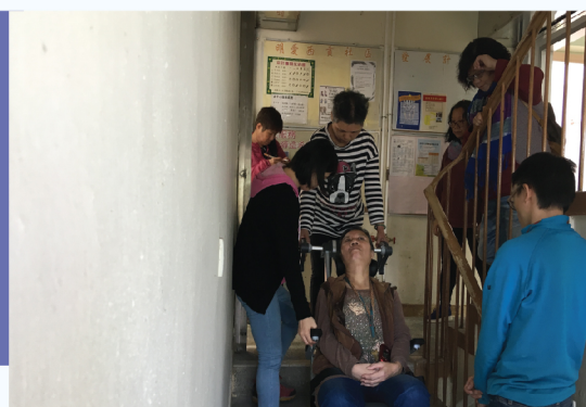
• Use of stair climber in order to maintain the mobility of elderly and relieve the burden of carers

Caritas Sai Kung Community Development Project has mobilized carers and volunteers in forming a community mutual help group to design a friendly environment for the elderly. Besides, the project was supported by the Wing Wah Charity Foundation to purchase a stair climber for the home-bound elderly to move up and down stairs.