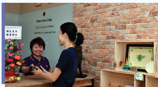
• New site was opened to the public