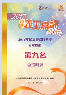
• Highest Service Hour Award 2016 (Public Organizations) - 8th runner-up

The Division was awarded the 8th runner-up in the Highest Service Hour Award 2016 (Public Organizations) at the Hong Kong Volunteer Award Presentation Ceremony organized by the Social Welfare Department ("SWD") on 9 December 2017. There were 13,578 registered volunteers in the year of 2016, who achieved a total of 486,623 service hours.