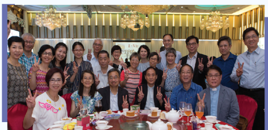
• Thanks for the support of Caritas senior management and government official

To commemorate the 40th Anniversary of Caritas Rehabilitation Service, a series of signature events was held throughout 2017 to express the aspiration of "love" and "care" for persons with disabilities and their families. A banquet with over 700 participants was held on 16 September 2017 to celebrate the achievements and to express the Service's gratitude towards the unfailing support of different stakeholders. The event demonstrated a concerted effort of staff, volunteers, strategic partners and families to create an inclusive community for persons with disabilities.