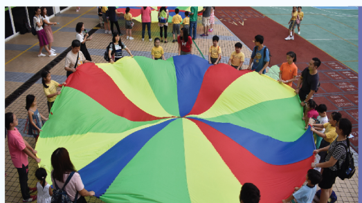
• The parents and their children were playing happily in the Fun Day