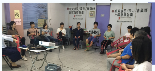
• Stretching exercise to release body pain

The Service has continuously organized various programmes in different districts to identify high-risk individuals who are potentially suffering from body strain and / or mental health problems, and to provide them with appropriate services. In the year 2017/2018, Caritas Residents Mutual Help Centre – Kwai Chung has reached 1,500 low income labourers in which over 90% of them have strain problem on at least one part of their body. The results were announced in a press conference and were published in "The Primary Assessment Report of the Work-related Musculoskeletal Disorder of the Low Income Labourers in Hong Kong".