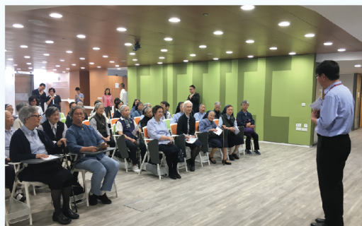
• Introduction of the Centre's service to visitors

The Centre was set up on 1 March 2018 at Level 9 of the new campus of CIHE in Tseung Kwan O. It was a joint venture with CIHE to provide comprehensive support services to the carers to cope with their needs arising from their caring duties as well as to develop positive coping strategies and build up harmony relations with the family members of the carers. Students from different learning programmes of CIHE would be mobilized to participate in service learning projects organized by the Centre.