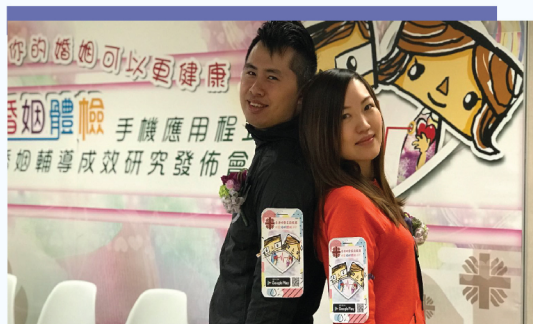
• Put core values of marriage into action

Caritas Family Service had launched the first "Mobile Application for Marriage Check-up" in Hong Kong, both for iPhone and Android users on 4 February 2018. It aimed at providing user-friendly and trendy ICT platform for self-administrated check up on marital relationship, online registration for marriage enrichment programmes, database of articles, bookmarks, videos and community resources for married couples.