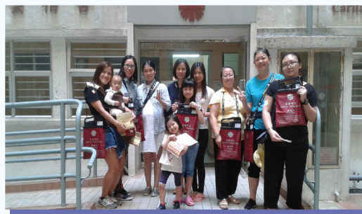
• Residents of Caritas Jockey Club Hostel - Choi Wan joined the Caritas Flag Day as volunteers

users, including unwed-mothers, single mothers and their children were served. Twenty-two programmes were organized for the users to develop their potentials and problem solving abilities in the year, which included 4 educational programmes, 12 recreational programmes, 1 parent-child programme and 5 volunteer programmes. The attendance of participants was 354.