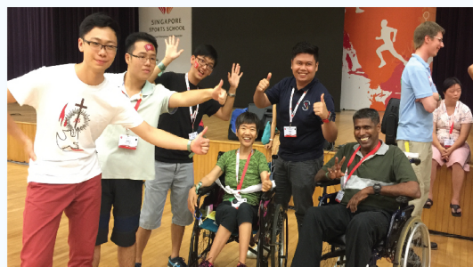
• The participants across different countries enjoyed the interactive games together