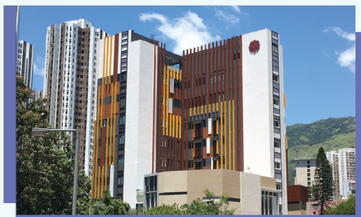
• The new Caritas Tsuen Wan Social Centre

Caritas Tsuen Wan Social Centre, situated at 9 Shing Mun Road, Tsuen Wan, had been providing multi-service for the deprived for more than 50 years since 1962. Owing to rapid social change and aging of the population, the Centre was redeveloped into a 10-storey building with modernized facilities to provide total quality service. The redevelopment was completed in September 2017 and five service units were set up in the new building: District Support Centre for Persons with Disabilities, Day Care Centre for the Elderly, Care and Attention Home, Community Centre and Family Development Centre. The services commenced in full strength in December 2017.