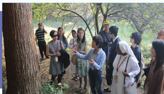
• Visit of social enterprise – a farmland run by persons with disabilities