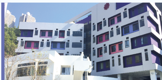
• Caritas Mother Teresa Hall

Interest groups, volunteer programmes and leisure activities were provided for the girls to develop their potentials. Workshops and developmental groups with the training of mindfulness and expressive arts were tailor-made for the girls to enhance their mental health.