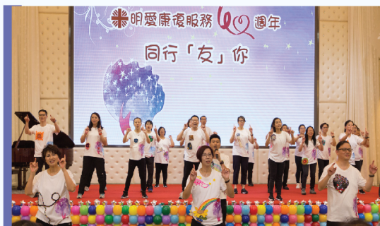
• Staff expressed the aspiration