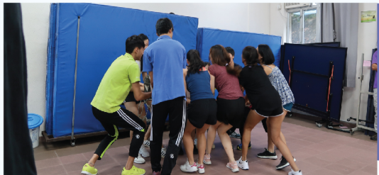
• Girls of Caritas Pui Tak Centre learned how to overcome difficulties through adventure-based activities

The Centre provides 24 hours residential care service for girls aged 16 to 21 with behavioural, emotional and family problems. The serving capacity is 28. The occupancy rate of the year was 89% and 37 girls were served. Five educational programmes, 9 recreational programmes and 2 volunteer services were organized for the girls with 236 attendance. Thirty-two sessions of clinical psychology treatment were also provided to girls with special needs.