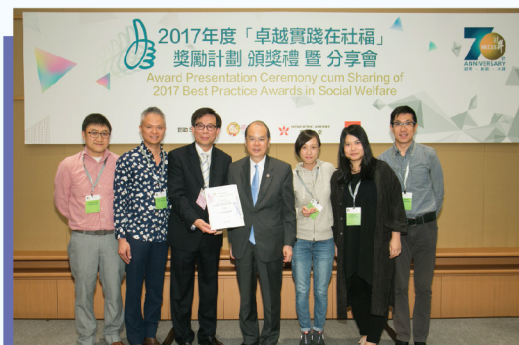
• Top Ten Best Practice Award

The project “Gato House” received the “Top Ten Best Practice Award” under the “Best Practice Awards in Social Welfare” organized by HKCSS. This project aims at improving the mental health and life skills of the drug abusers and rehabilitees through animal assisted activities such as drug counselling (e.g. individual based and group counselling, life and death education) and vocational training cum work placement. Outreaching services were also provided.