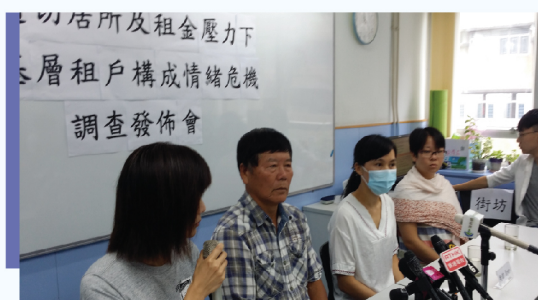
• Press conference on the survey findings

Two surveys regarding grassroots families' difficulties in acquiring affordable accommodation had been conducted. The 1st survey revealed that over 40% of respondents tended to have depression and anxiety symptoms because of high rent. The 2nd survey further revealed that the average monthly rent for subdivided flats in Sham Shui Po had increased from $3,681 in 2016 to $4,062 in 2017 while the average living area of subdivided flat had fallen from 50 to 45 square feet. The two reports were announced in the press conference and were widely reported by the mass media.