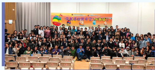
• Navigation Scheme's trainees in the Mutual Appreciation Ceremony

the elderly and rehabilitation services and at the same time to study a part-time diploma course. A total of 138 trainees had enrolled in the Scheme for the year of 2017/2018.