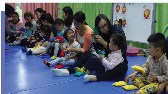
• Parents nurture kid's positive character through parent-child interaction

An initiative of Caritas Strength Club was pioneered by Caritas Integrated Family Service Centre - Tsuen Wan to equip parents with the attitude and skills in establishing positive values and characters in their 2 to 3 years old pre-school children. The 24-session parent-child group was structured on the concept of 6 virtues and 24 characters strength from Peterson and Seligman (2004). Effectiveness of the service was evaluated by pre-group and post-group measures and indicated that parents reduced their level of depression, anxiety and stress.