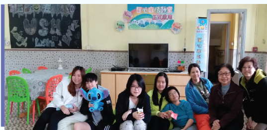
• New Activity Room at Caritas Pelletier Hall

Effective September 2017, target service users were extended to include Primary 5 students. A living group for primary students with new service programmes were implemented to cater for the needs of these younger residents. On the other hand, making use of the space of a dormitory, a new Activity Room was specially decorated providing various leisure facilities for the residents.