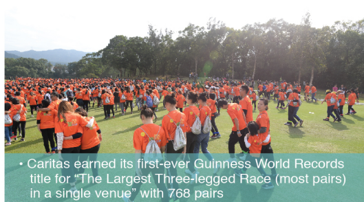
• Caritas earned its first-ever Guinness World Records title for “The Largest Three-legged Race (most pairs) in a single venue” with 768 pairs

The Industrial & Commercial Bank of China (Asia) has taken up the chairmanship of the Campaign for 20 consecutive years. This year, the total amount raised from the Campaign came to a record high of $35.52 million, which included $6.89 million from the six bazaars, $13.15 million from the sale of raffle tickets, $1.42 from the Charity Golf Day and $14.06 million donation from general and the Friends of Caritas (through fundraising activities like Charity TV Show and Charity Cantonese Opera Singing Concert).