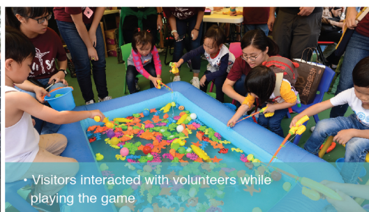
• Visitors interacted with volunteers while playing the game

The Industrial & Commercial Bank of China (Asia) has taken up the chairmanship of the Campaign for 20 consecutive years. This year, the total amount raised from the Campaign came to a record high of $35.52 million, which included $6.89 million from the six bazaars, $13.15 million from the sale of raffle tickets, $1.42 from the Charity Golf Day and $14.06 million donation from general and the Friends of Caritas (through fundraising activities like Charity TV Show and Charity Cantonese Opera Singing Concert).