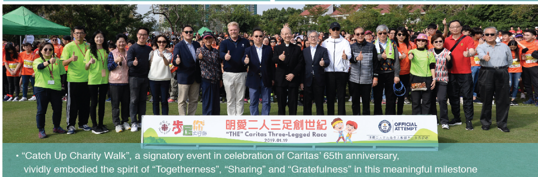
• “Catch Up Charity Walk”, a signatory event in celebration of Caritas’ 65th anniversary, vividly embodied the spirit of “Togetherness”, “Sharing” and “Gratefulness” in this meaningful milestone