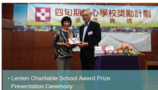
• Lenten Charitable School Award Prize Presentation Ceremony