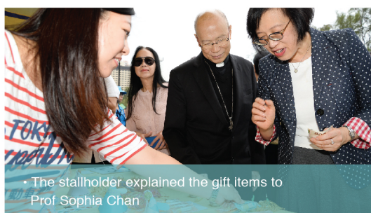
• The stallholder explained the gift items to Prof Sophia Chan