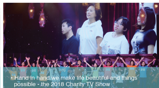
• Hand in hand we make life beautiful and things possible - the 2018 Charity TV Show