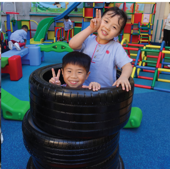
• Positive education emphasises on commitment, engagement and achievement