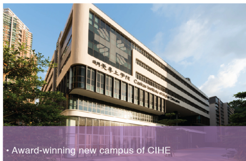
• Award-winning new campus of CIHE

The new campus of CIHE, conveniently located above the Tiu Keng Leng MTR Station, has won the Merit Award under Quality Building Award (QBA) 2018, in the category of Hong Kong Non-residential (New Building – Government, Institution or Community), and the Public Service Architecture (Hong Kong) Award of the Asia Pacific Property Awards for 2018/2019.