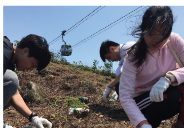
• Planting Day - Caritas Charles Vath College