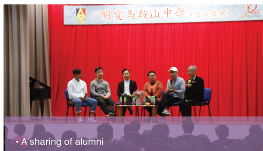
• A sharing of alumni