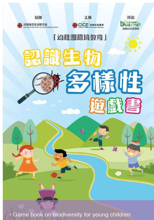
• Game book on biodiversity for young children