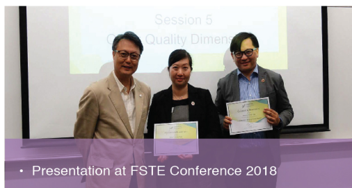
• Presentation at FSTE Conference 2018

With the support of CSE, CICE conducted a territory-wide survey on the needs for community care and support services for the elderly. CICE presented the survey findings in a press conference on 21 July 2018 which were widely reported in news media. The range and priority of health and social care needs from the elderly who prefer “ageing in place” have implications to both vocational education programmes and professional services.