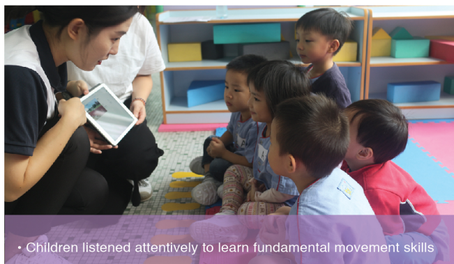
• Children listened attentively to learn fundamental movement skills

Physical activity is very important for the holistic development in early childhood. With the aims of improving children's health-related physical activity participation and their fundamental movement skills, SFKG participated in a research study on physical activity and movement skills of children which was conducted by the Department of Sports Science and Physical Education, The Chinese University of Hong Kong.