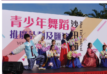
• Performance of School Dancing Team - Caritas Ma On Shan Secondary School