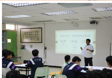
• Class in progress - Caritas Tuen Mun Marden Foundation Secondary School