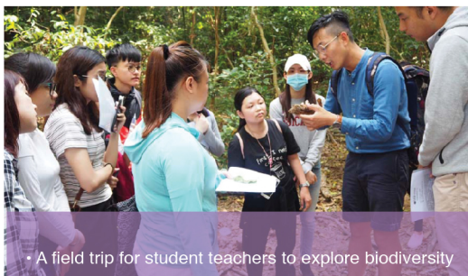
• A field trip for student teachers to explore biodiversity