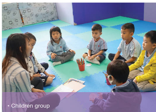
• Children group

To tackle the developmental and behavioural issues of young children, particularly the emotion and mental health, as well as to support families in parenting, Caritas St. Francis Kindergarten (“SFKG”) and Caritas Ling Yuet Sin Kindergarten (“LYSKG”) launched the “Child Development and Family Support Service Scheme” in November 2018 with the collaboration of Caritas Family Service. Parent talk, children group and case interviews were organized. A parent newsletter was also published in December 2018.