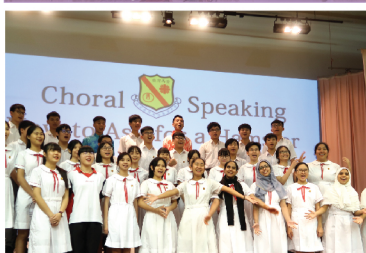
• Performance of School Chorus - Caritas Chai Wan Marden Foundation Secondary School