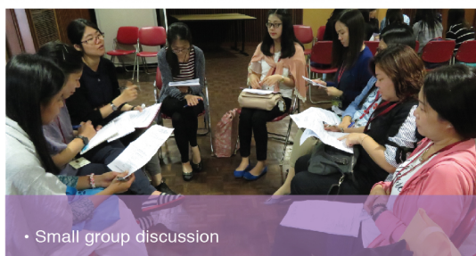
• Small group discussion