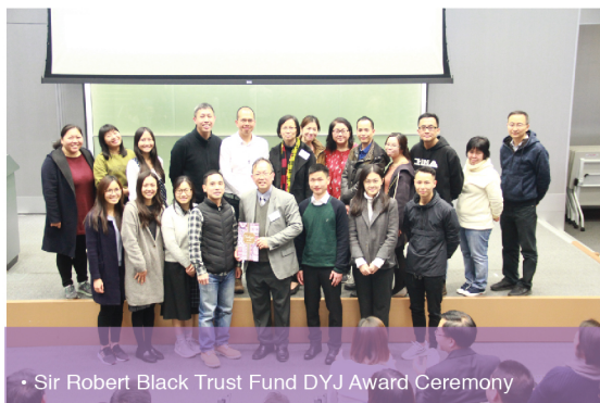
• Sir Robert Black Trust Fund DYJ Award Ceremony