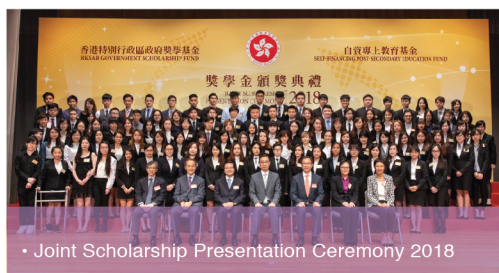
• Joint Scholarship Presentation Ceremony 2018

In 2018, the Secretary for Education has endorsed a total of 113 students from CIHE and CBCC to receive the "Outstanding Performance Scholarship", "Best Progress Award", "Talent Development Scholarship", "Reaching Out Award" and "Endeavour Scholarship" under the Self-financing Post-secondary Scholarship Scheme.