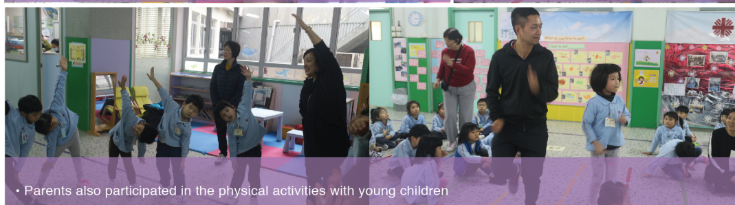
• Parents also participated in the physical activities with young children