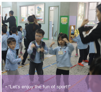
• “Let’s enjoy the fun of sport!”