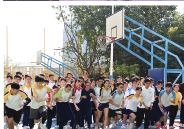
• Round-the-school Run - Caritas Yuen Long Chan Chun Ha Secondary School