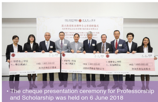
• The cheque presentation ceremony for Professorship and Scholarship was held on 6 June 2018

CIHE received donations from Alfar Charitable Trust ("Alfar") and GS Charity Foundation Limited in support of two professorships in the School of Business and Hospitality Management to further enhance the capability both in teaching and research. In addition, Alfar made a donation to set up a scholarship for needy students in both CIHE and CBCC.