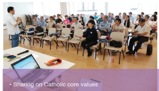
• Sharing on Catholic core values