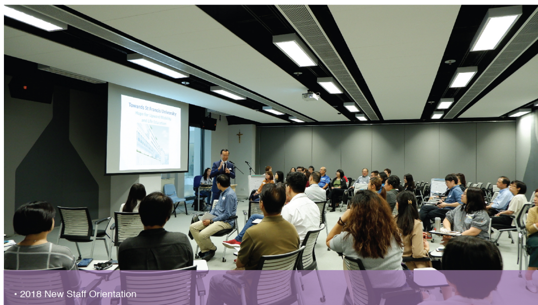
• 2018 New Staff Orientation

CIHE and CBCC have consistently been making effort to build and provide a caring and supportive working environment for staff, making available in earnest diverse training and development opportunities, to sustain a competent and professional staff force. A total of 11 in-house and 10 collaborated programmes in various areas of professional training and development were conducted in 2018.