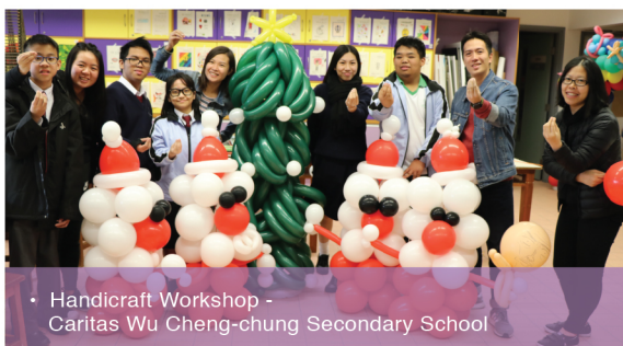
• Handicraft Workshop - Caritas Wu Cheng-chung Secondary School

A balanced and broad curriculum is offered to students of Caritas secondary schools (8 aided schools and 1 Direct Subsidy Scheme school) and Field Studies Centre.