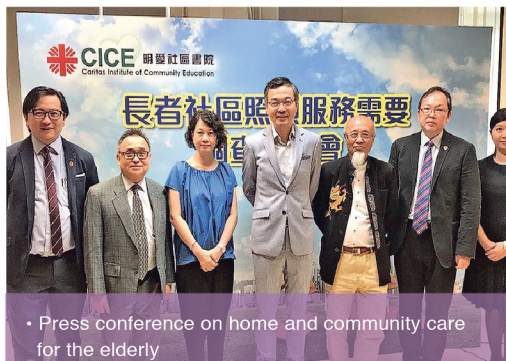
• Press conference on home and community care for the elderly

With the support of CSE, CICE conducted a territory-wide survey on the needs for community care and support services for the elderly. CICE presented the survey findings in a press conference on 21 July 2018 which were widely reported in news media. The range and priority of health and social care needs from the elderly who prefer “ageing in place” have implications to both vocational education programmes and professional services.