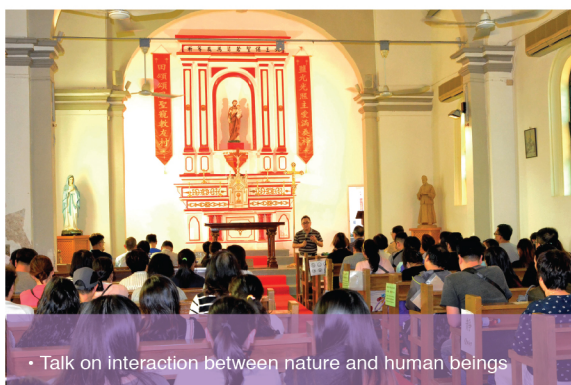
• Talk on interaction between nature and human beings

CICE recognizes the importance of personal and professional development of all its staff members, particularly in view of the fast-changing environments in community education. In 2018/2019, academic and administration staff of CICE participated in a total of 51 programmes; of these 8 were in-house training courses and 43 were offered by external professional organizations. CICE's annual staff development day was held on 23 November 2018 at Yim Tin Tsai Village. Apart from visiting historical buildings and sea salt production at the village, participants were given a talk on the interaction between nature and human beings as well as the related Catholic social teaching.