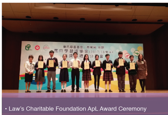
• Law's Charitable Foundation ApL Award Ceremony