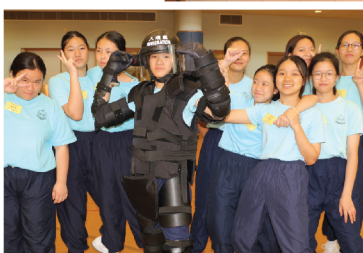
• Enhanced Smart Teen Project - Caritas St. Joseph Secondary School