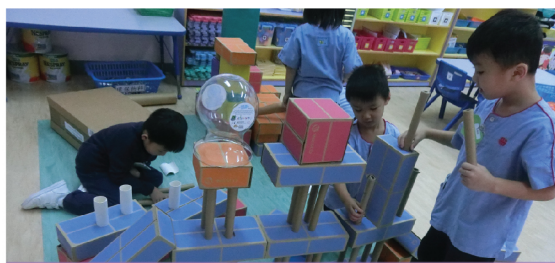
• Children learn spontaneously with personal choice

LYSKG promoted positive education and encouraged teachers to explore and develop the inner potential of young children with an optimistic, positive and caring attitude in order to foster the children's positive attitude towards learning and life. Home-school collaboration was also strengthened and a school culture of positive education was built for promoting the development of whole child.