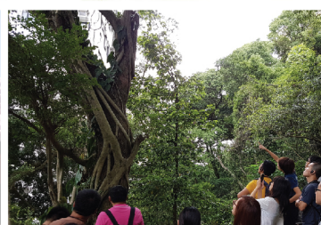
• Outdoor Field Trip - Caritas Chan Chun Ha Field Studies Centre