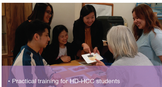
• Practical training for HD-HCC students

In the process of designing the HD-HCC programme, CICE’s programme development team has studied in-depth the macro and micro environments influencing community-based health and social care services to elderly people in Hong Kong. Two staff members have further consolidated their programme development experiences and shared their insights in a paper titled “Quality of Programme for Quality of Care: Curriculum Development of a Vocational Education Programme for Community Care for the Elderly in Hong Kong”. The paper was presented at the Conference of the Federation for Self-financing Tertiary Education on 1 June 2018.