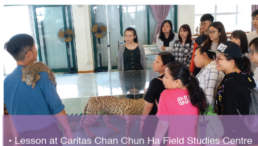
• Lesson at Caritas Chan Chun Ha Field Studies Centre

With sponsorship from the Language Fund, CICE was commissioned by The Standing Committee on Language Education and Research to offer a 40-hour programme in Chinese Language Enhancement Programme for Kindergarten Teachers in December 2018. The programme aimed to enhance teachers' competence to design appropriate Chinese language activities in class; and cater children's different learning needs in their Chinese language and literacy development.