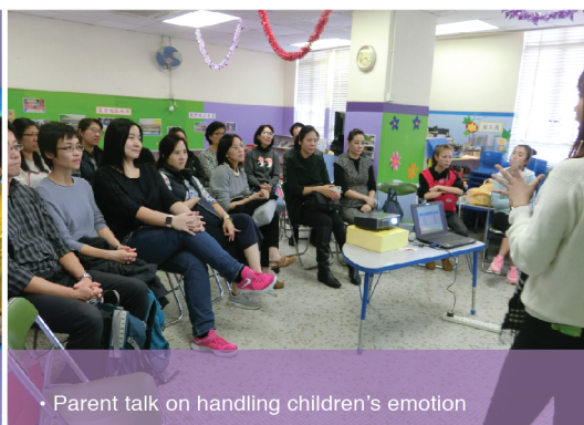
• Parent talk on handling children's emotion