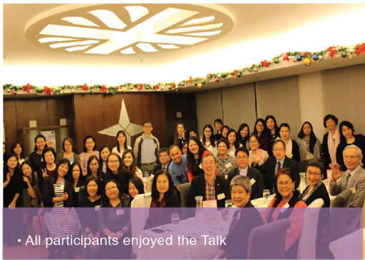
• All participants enjoyed the Talk