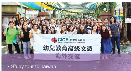
• Study tour to Taiwan