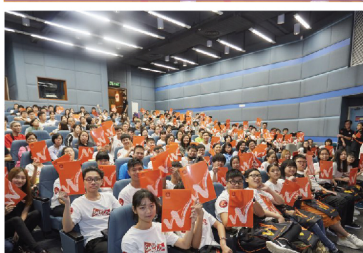
• Project WeCan - Caritas Fanling Chan Chun Ha Secondary School