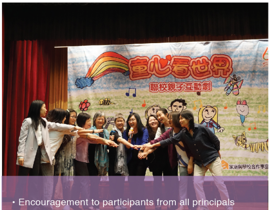
• Encouragement to participants from all principals

A Service Development Day with the theme “Together We Build the Brand for Quality Early Childhood Education” was held on 12 May 2018. Participants were engaged in the reflection on the results of service survey on branding collected from the parents and teaching staff and discussed strategies for pursuing quality service.