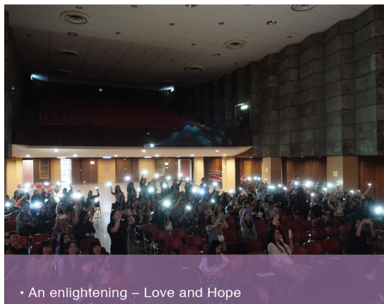
• An enlightening – Love and Hope