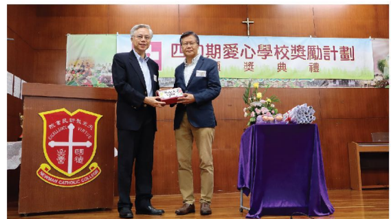
Lenten Charitable School Award Prize Presentation Ceremony

Caritas supported the Committee in the Lenten Charitable School Award Scheme which received positive response from 110 Catholic schools and kindergartens with a total of 56,222 entries. The prize presentation ceremony was held in May 2019.