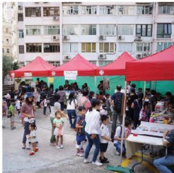
Mini-bazaars gathered the community together to show support for Caritas

Over 450 units, including parishes, mass centres, schools, organizations and Caritas service units participated in this year’s Campaign. Although the annual bazaars this year had been changed to a different format in light of the society situation, the appeal for support made to parishes, schools and associations were still met by impressive responses. Instead of taking place in six districts, 313 mini-bazaars had been held across the territory with the participation of about 150 units and assistance from numerous enthusiastic volunteers and parishioners.