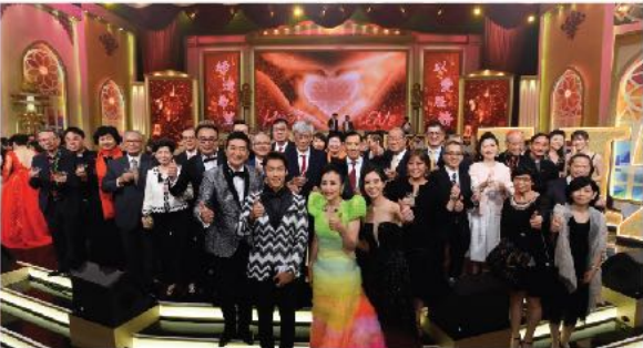
Charity TV Show is a showcase for Caritas’ caring services