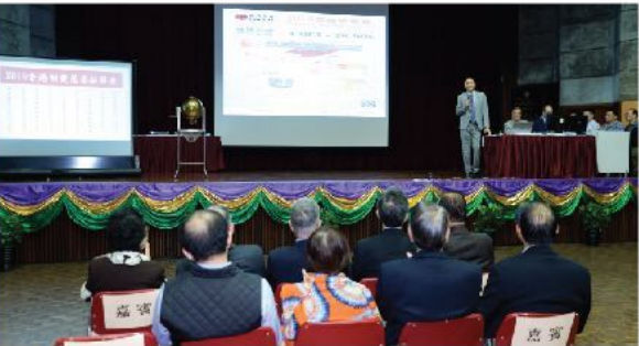
2019 Raffle Ticket Draw