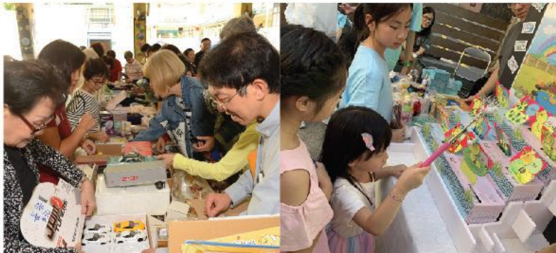
Visitors enjoyed shopping and playing booth games at mini-bazaars

The Industrial & Commercial Bank of China (Asia) has taken up the chairmanship of the Campaign for 21 consecutive years. This year, the total amount raised from the Campaign was $34.93 million, which included $4.19 million from the bazaars, a record high of $13.86 million from raffle tickets sale, $1.37 million from the Charity Golf Day and $15.5 million from general donations and fundraising events like Charity TV Show.