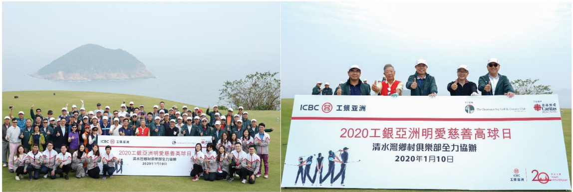
2020 Charity Golf Day