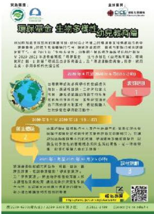
Biodiversity Education in Kindergartens