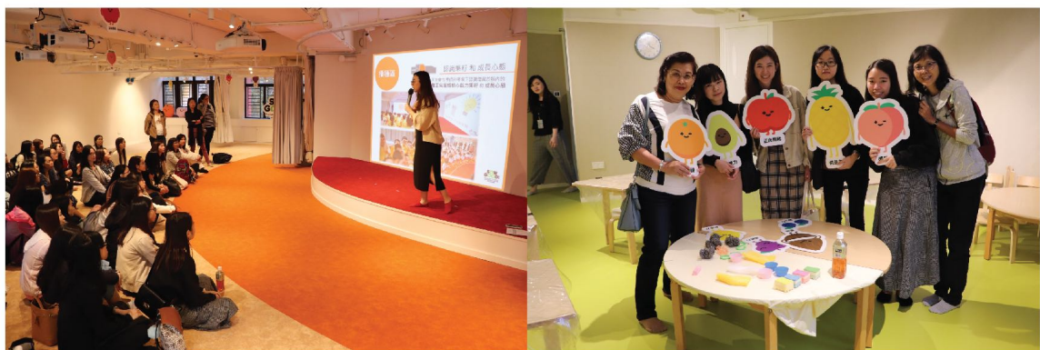
Teachers at the Sowgood Positive Education Centre