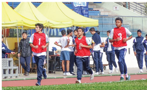
Sports Day - Caritas Tuen Mun Marden Foundation Secondary School