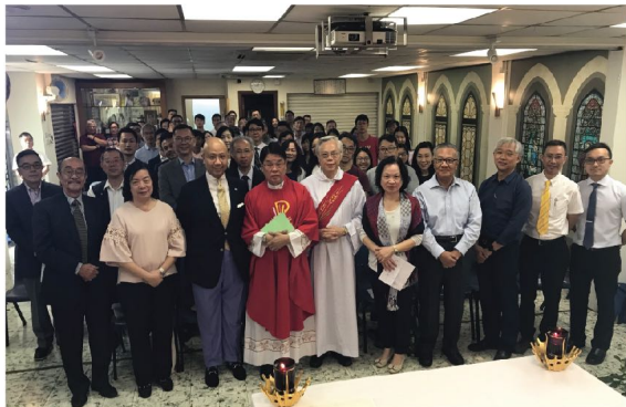
The celebrant and the attendees of the mass

A mass was celebrated on 21 September 2019, followed by a sharing session on Catholic values. Caritas Assistant Chief Executive shared the theme “Edifying of the body of Christ” to School Supervisors, School Managers and Catholic staff of Caritas secondary schools.