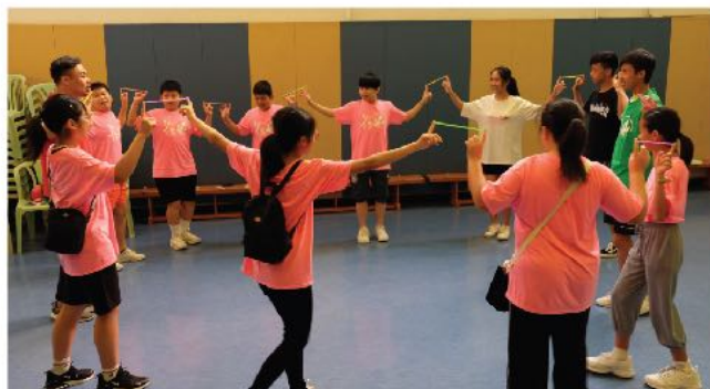
Positive Education Activity for S1 students - Caritas Yuen Long Chan Chun Ha Secondary School