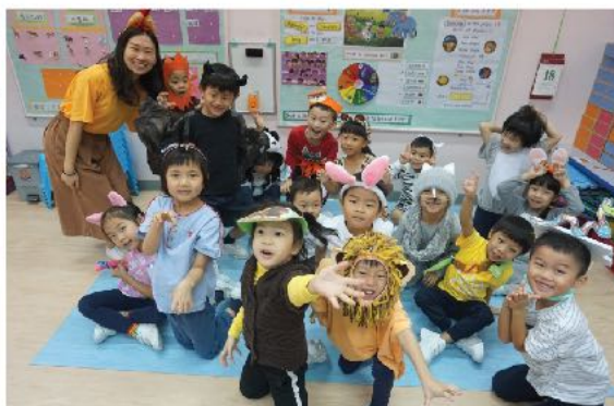
“What a lovely Animal Day!”