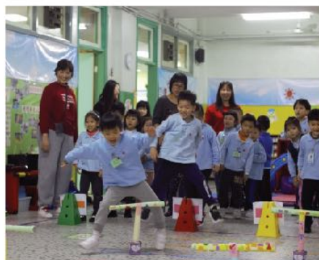
"Let's play the hurdle game!"