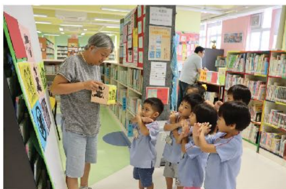
Children listen to the rules in library attentively

A new initiative "Promotion of Reading Grant for Kindergartens" was launched by the Education Bureau ("EDB") in the 2019/2020 school year. The two kindergartens used the grant flexibly not only for the procurement of books, but also for organizing diversified, interesting and appropriate reading activities to create a culture of reading in order to enhance children's interest in this area.