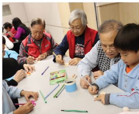
"Thanks Grandpa, let's write the blessings!"