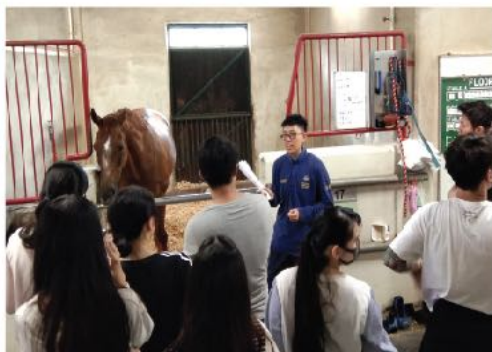
Visit to riding school - Caritas Charles Vath College