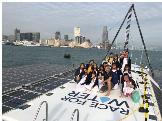
Visit to the “Race for Water Odyssey” - Caritas St. Joseph Secondary School

A balanced and broad curriculum is offered to students of Caritas secondary schools (8 aided schools and 1 Direct Subsidy Scheme school) and the Field Studies Centre.