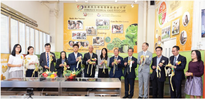
The kick-off ceremony cum knowledge sharing session on 5 November 2019