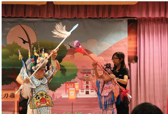
Caritas Lok Yi School: The Cantonese Opera named “Mu Guiying Epilogue” won the Golden Award of Best Visual Effect and Golden Award of Costume Design in the 12th Arts Exchange Programme co-organized by joint-school for students with severe intellectual disabilities