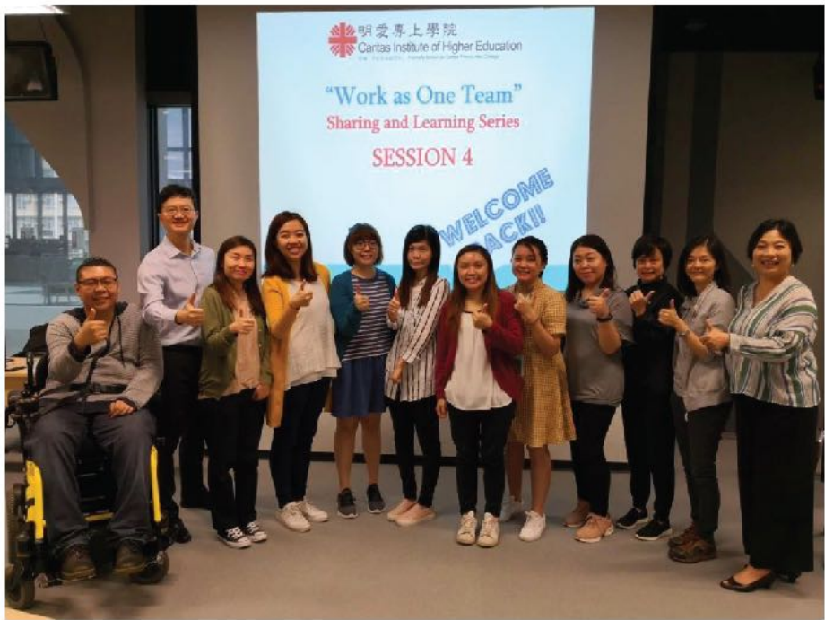
Work as one team

CIHE and CBCC value the continuous improvement of staff, and thus a total of 29 staff development activities in various areas were conducted. Among them, 22 were in-house programmes and 7 were collaborated programmes.