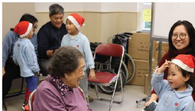
Visit to an Elderly Centre "Grandmom, what do you like for your Christmas gift?"

With the theme "Share Love with Others", the two kindergartens launched the Campaign to both children and parents in December 2019 for nurturing love at schools, at home and in the community. Children learned the attitude of thankfulness through presenting their hand-made gifts to family members as well as to the elderly.