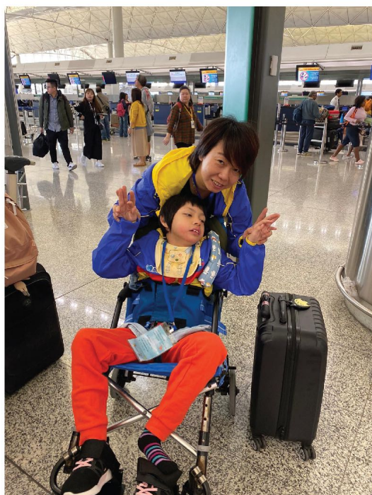
Caritas Lok Kan School: A student won in "I Believe I Can Fly" programme sponsored by Invision Charity Foundation Limited and enjoyed the 1st flight experience