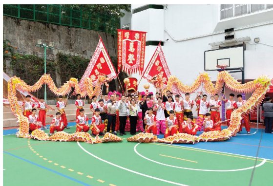
Lion Dance Team - Caritas Chai Wan Marden Foundation Secondary School