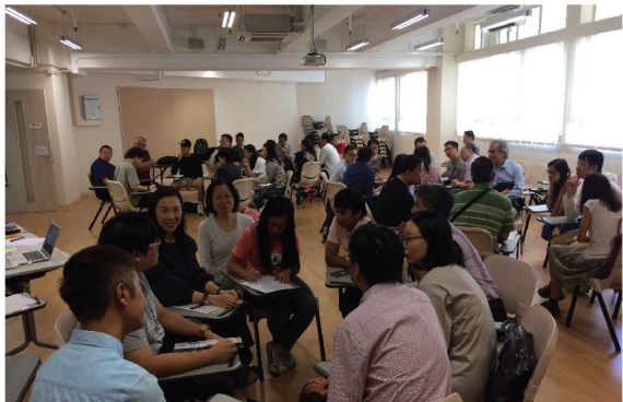
Group sharing of views on Catholic values