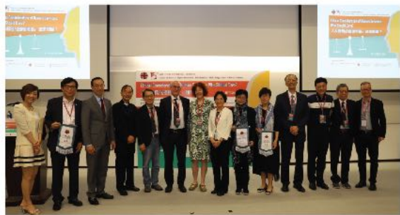
"Ethical Consideration of Human Services: Who Should Care?" Conference

To celebrate its 15th anniversary, Felizberta Lo Padilla Tong School of Social Sciences organized an International Conference on "Ethical Consideration of Human Services: Who Should Care?" on 13 June 2019 and 14 June 2019 in CIHE. Four renowned scholars from the United Kingdom, Australia, Taiwan and Hong Kong were invited to share their views towards the theme.