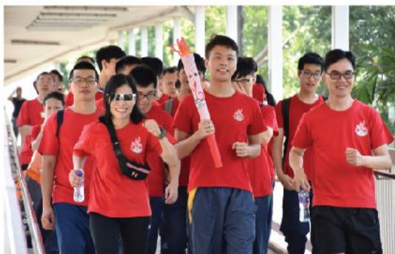
Kick-off run for the 50th Anniversary – Caritas Chong Yuet Ming Secondary School