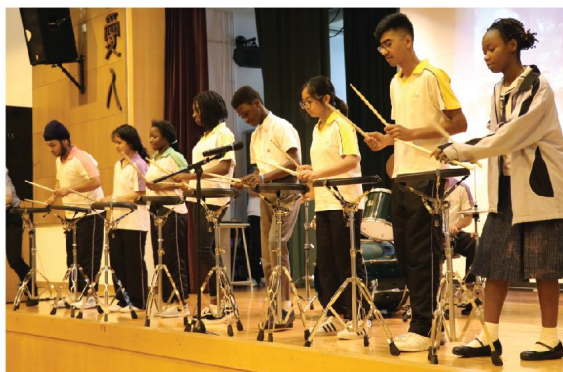
Drum performance - Caritas Wu Cheng-chung Secondary School