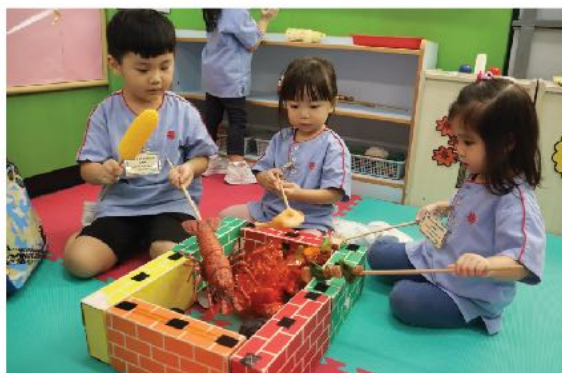
Learning through play “Let’s share the food together.”

The objective of the Pre-school Education Service is to provide a pleasant learning environment for young children below the age of seven to develop morally, intellectually, physically, socially, aesthetically and spiritually according to their own natural abilities.