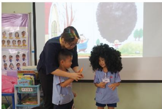
Role play by children