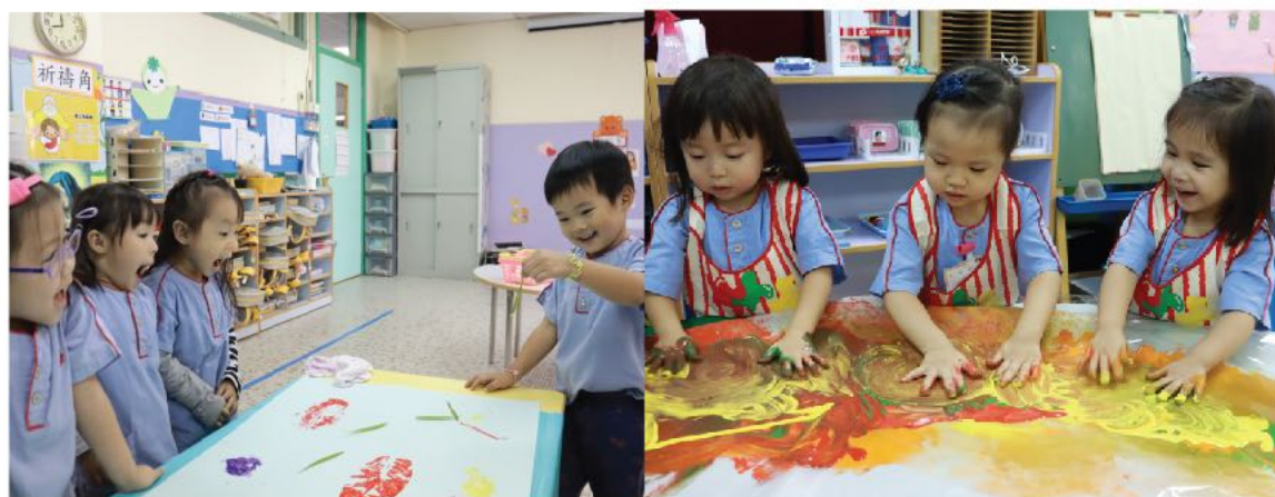
Fun with creative art