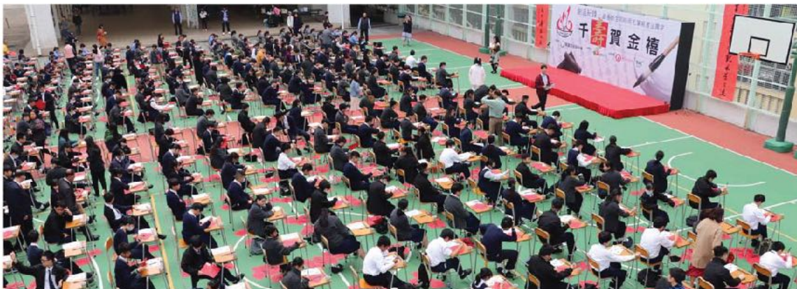
Chinese Calligraphy Activity for the 50th Anniversary – Caritas Chong Yuet Ming Secondary School