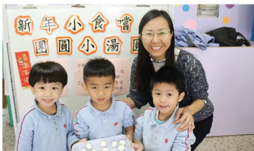
Parents are always our best partners