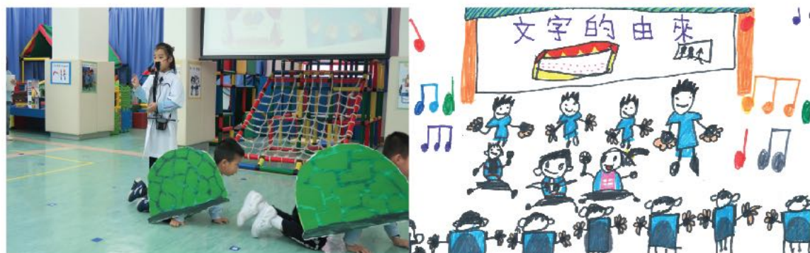
A drama presented by children to tell the story on "Origin of Chinese Character"

To facilitate Interactive learning among young children In order to enhance their language competency and stimulate their creativity, Caritas St. Francis Kindergarten and Caritas Ling Yuet Sin Kindergarten collaborated with other Caritas nursery schools In organizing a series of Interesting language activities. These activities have exhibited children's wisdom and joy In learning.