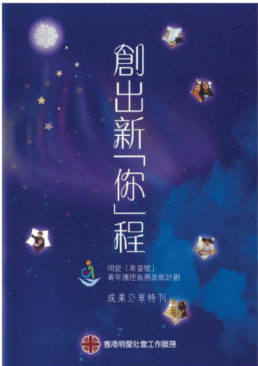
Special edition booklet