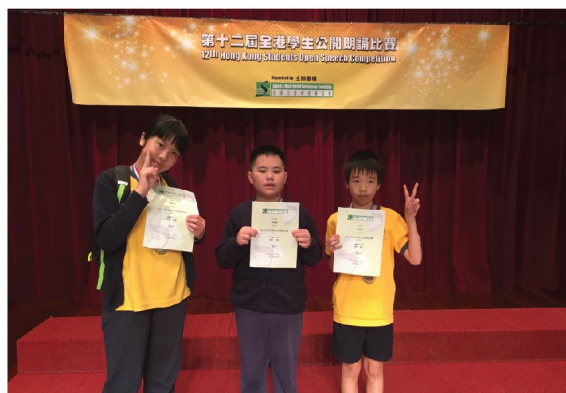
Caritas Lok Jun School: The students won the first runner-up of Verse Speaking and Tongue Twister respectively in the 12th Hong Kong Students Open Speech Competition