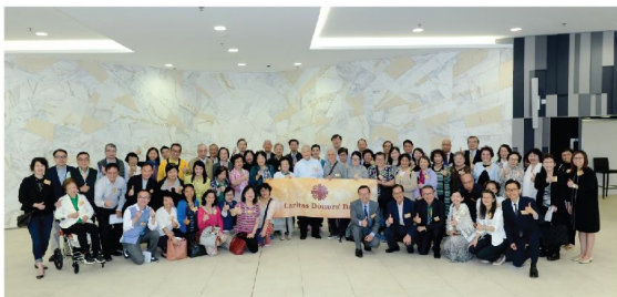
Caritas Donors’ day

CIHE was ranked first among all self-financing institutions in the amount raised under the Government’s Seventh Matching Grant Scheme, which ran for two years from 1 August 2017 to 31 July 2019. A total donation of $272 million was raised and $100 million government matching grant was received through the Scheme.