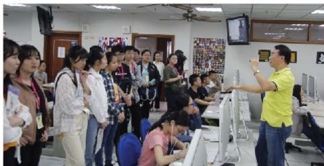
Study Tour in Taiwan - Caritas Ma On Shan Secondary School