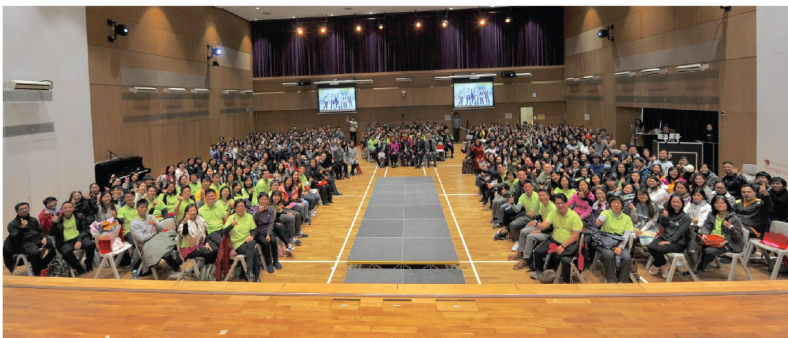
Celebrating the 40th anniversary of Caritas Special Education Service: variety show cum sharing