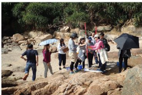
Outdoor field studies - Caritas Chan Chun Ha Field Studies Centre