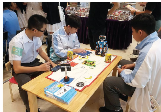
STEM activity - Caritas Fanling Chan Chun Ha Secondary School