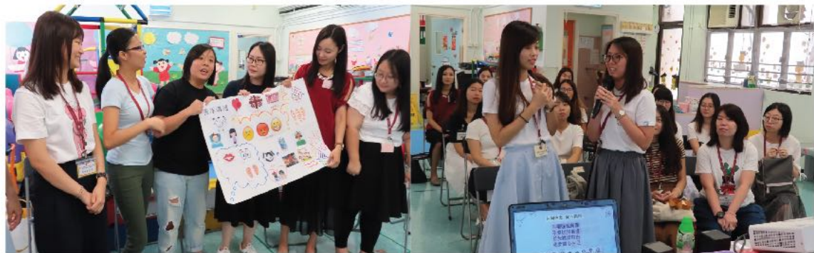
New teachers sharing on Orientation Day

Two half-day Induction Programmes were organized on 21 September 2019 and 12 October 2019 with a total participation of 31 new teachers. The uniqueness of Caritas pre-school pedagogy and curriculum was Introduced, Including the Moral and Religious Curriculum, Integrated Curriculum and Free Play, Whole Language Learning Approach, English Learning, Early Mathematics, Nature and Science Learning.