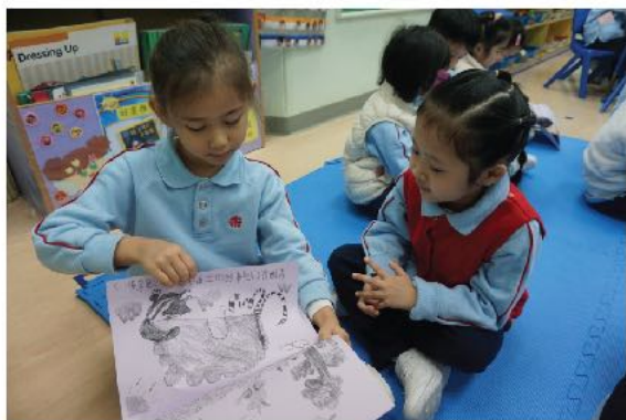
Elder brother and sister read self-written stories to the younger ones