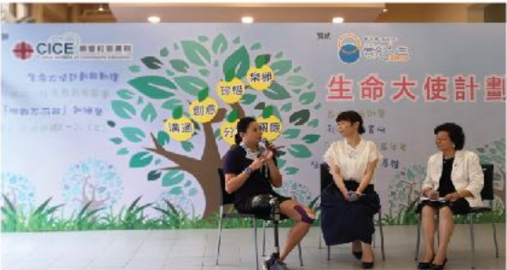
Presentation and sharing in Life Education Project