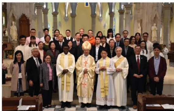
Mass for the 50th Anniversary – Caritas Chong Yuet Ming Secondary School