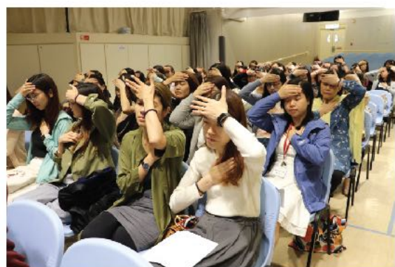
Mindfulness for teachers

Two Development Days were organized on 27 September 2019 and 25 November 2019 with a total participation of 162 and 166 teachers respectively. A feature talk on “Child Protection, Early Intervention” was delivered in the morning session of the 1st Development Day, followed by a discussion session on strategies for pursuing quality early childhood education in the afternoon. A visit to the Sowgood Positive Education Centre was arranged on the 2nd Development Day. All participants were deeply impressed by the rich experience at the Centre.