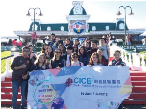
English language study tour in Gold Coast, Australia