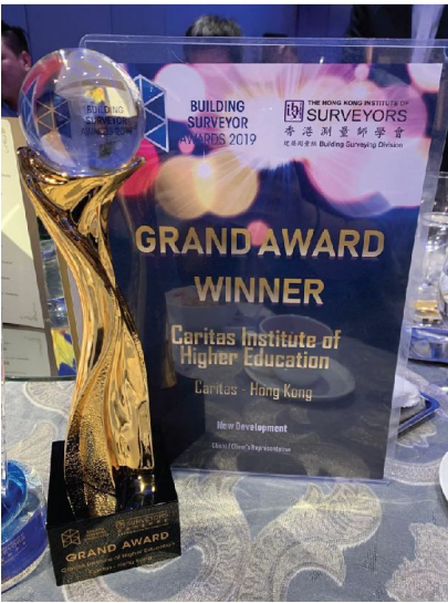
Building Surveyors Awards 2019

The new campus of CIHE further won the Grand Award as well as the Winner Award for New Development (Client / Client’s representatives) in the Building Surveyor Awards 2019 organized by The Hong Kong Institute of Surveyors.