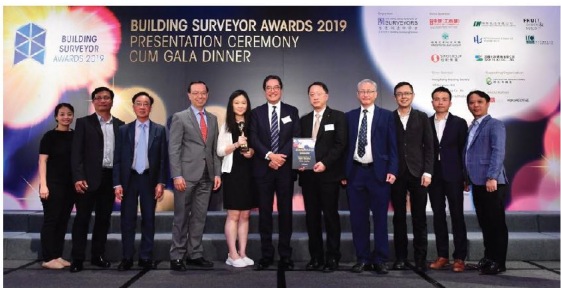
Building Surveyor Awards Presentation Ceremony