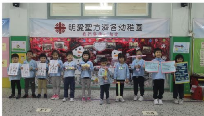
Children of three schools share their favorite sports