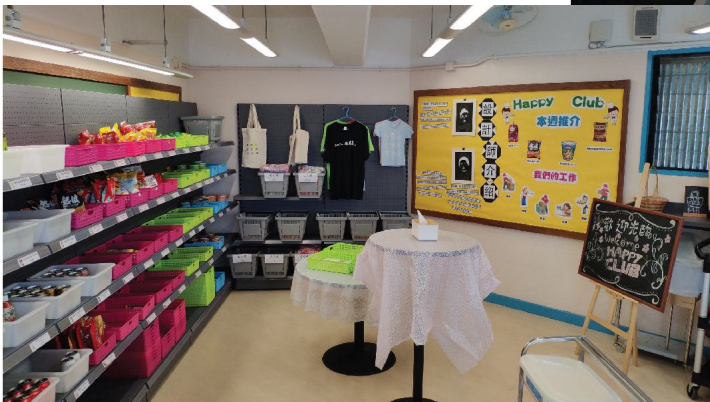
A supermarket simulating the real life retailing and customer experience