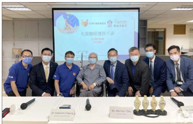
Free Total Knee Replacement Surgery for underprivileged patients