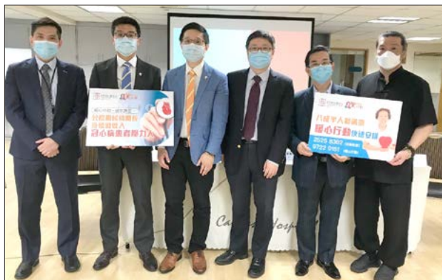
Percutaneous coronary intervention (PCI) services for Hospital Authority's patients