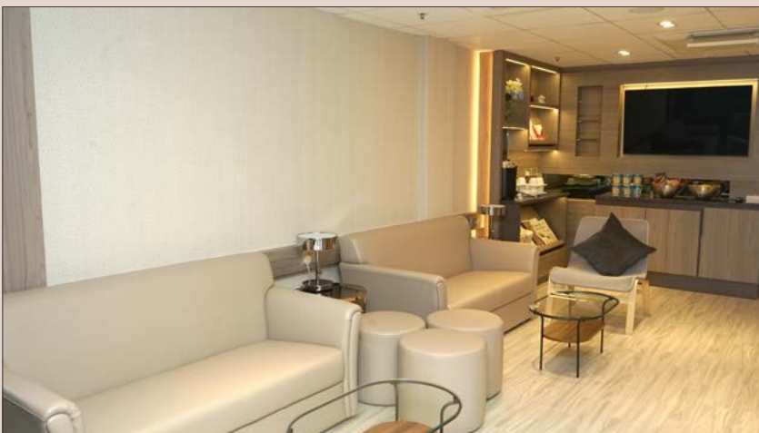
New doctor's lounge