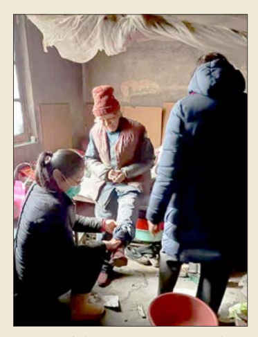
A sister helping a senior to put on socks during home visit in Shandong