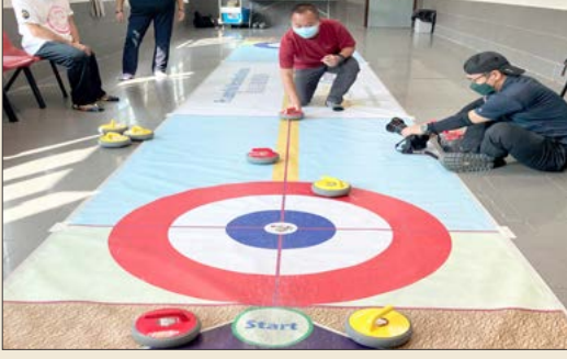
Precise judgment is all one needed in playing the floor curling

A staff training event was held on 13 December 2021 at Po Leung Kuk Jockey Club Pak Tam Chung Holiday Camp. The one-day event included a session to experience four new sports activities, namely, dodgebee, floor curling, Wing Chun and flipball, and a tour to the newly built dormitory and function rooms. The event helped to build team spirit among our colleagues and gave us the chance to assess the feasibility to include those activities in our camp service in future.