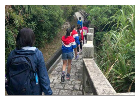
Small group of families participated in eco-cultural tour activity