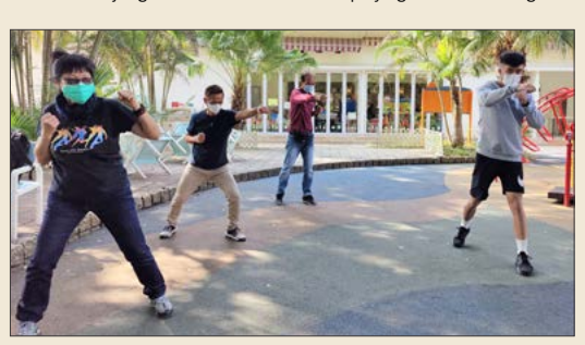
Learning Wing Chun is not as easy as it looks