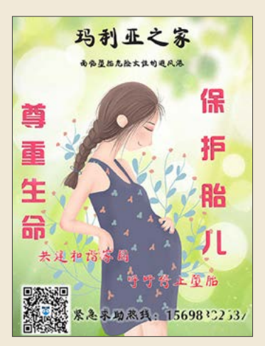
A programme of protection of the unborn in Shanxi