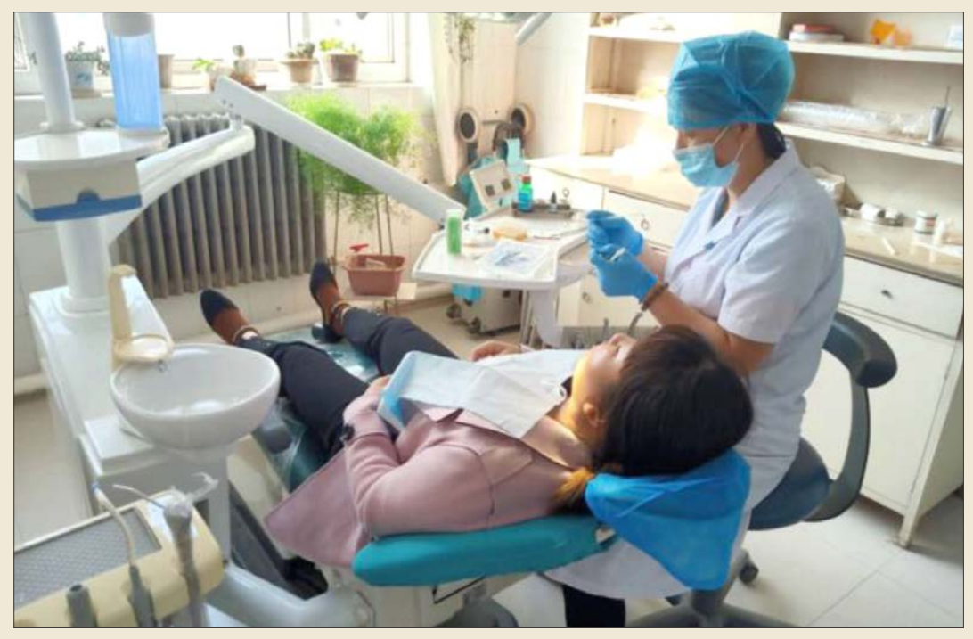
A dentist was examining the dental filling materials before putting it into the mouth of the patient