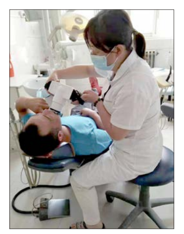
Tooth X-ray imaging machine is used for diagnosis