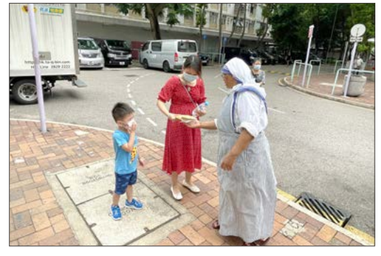
Frozen food pack was given to low income families by religious sisters of Missionaries of Charity