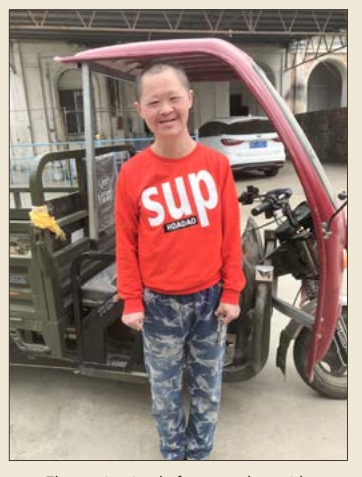
Electronic tricycle for an orphan with disability in Henan