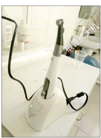
Root canal opener