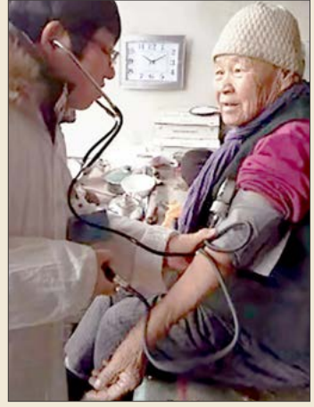
A sister checking blood pressure for a senior during home visit in Inner Mongolia