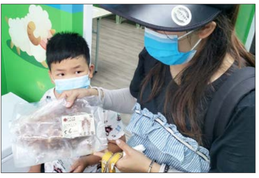
Frozen food pack was delivered to low income families by members of Mother of Christ Church