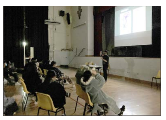
Introductory session was conducted before the star gazing activity

Under the Capital Accounts Block Vote Scheme, LCSD approved the amount of $1,158,820 and $216,760 for the waterproofing repair work and replacement of seven fire rated windows respectively at the Caritas Jockey Club Ming Fai Camp. Those works were essential to enhance the safety of the camp site and were completed in January 2022.