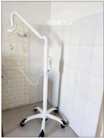
Cold light whitening machine