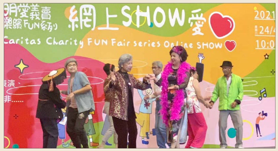
Caritas Charity Fun Fair series Online Show took place at Caritas Institute of Higher Education