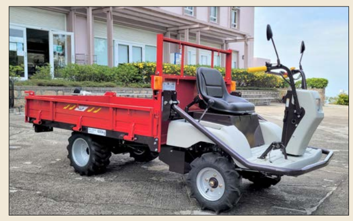
The brand new village vehicle

An amount of $89,000 was donated by The Sir Robert Ho Tung Charitable Fund to replace the damaged old village vehicle which was in use for over 15 years.