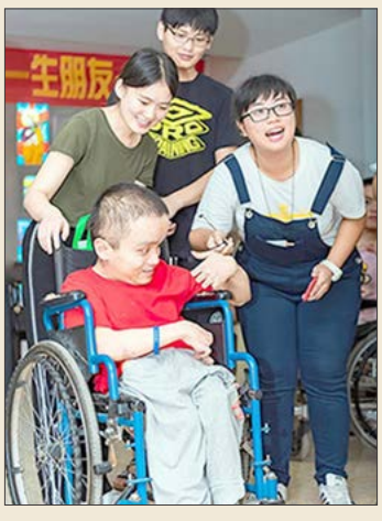
A social inclusion programme for people with disability in Hebei