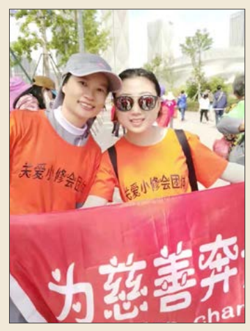
Fundraising for charity programmes in Dalian