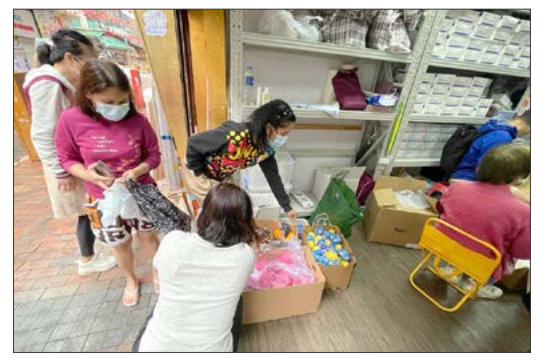
People in need collecting fruits at Mercy HK